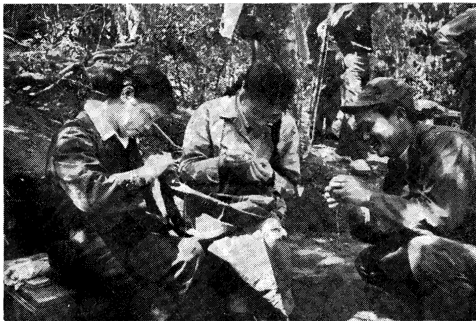
In a noble spirit of serving the world's people and fearing neither hardship nor fatigue, artists of China's Yunnan Acrobatic Troupe did all they could to serve the Laotian people during their visit to that country. (Left) Members of the troupe during an intermission do some mending for the fighters of the Laotian People's Liberation Army.