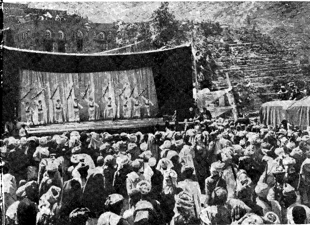
China's revolutionary art and literature has been warmly received by the Yemeni people. Audiences, giving high praise to performances by China's Folk Art Ensemble, have said: "They are really good! They show struggle, revolution. They encourage us to advance." (Left) A large audience in Ibb, the Yemen, watching the ensemble's Militia Women's Dance .