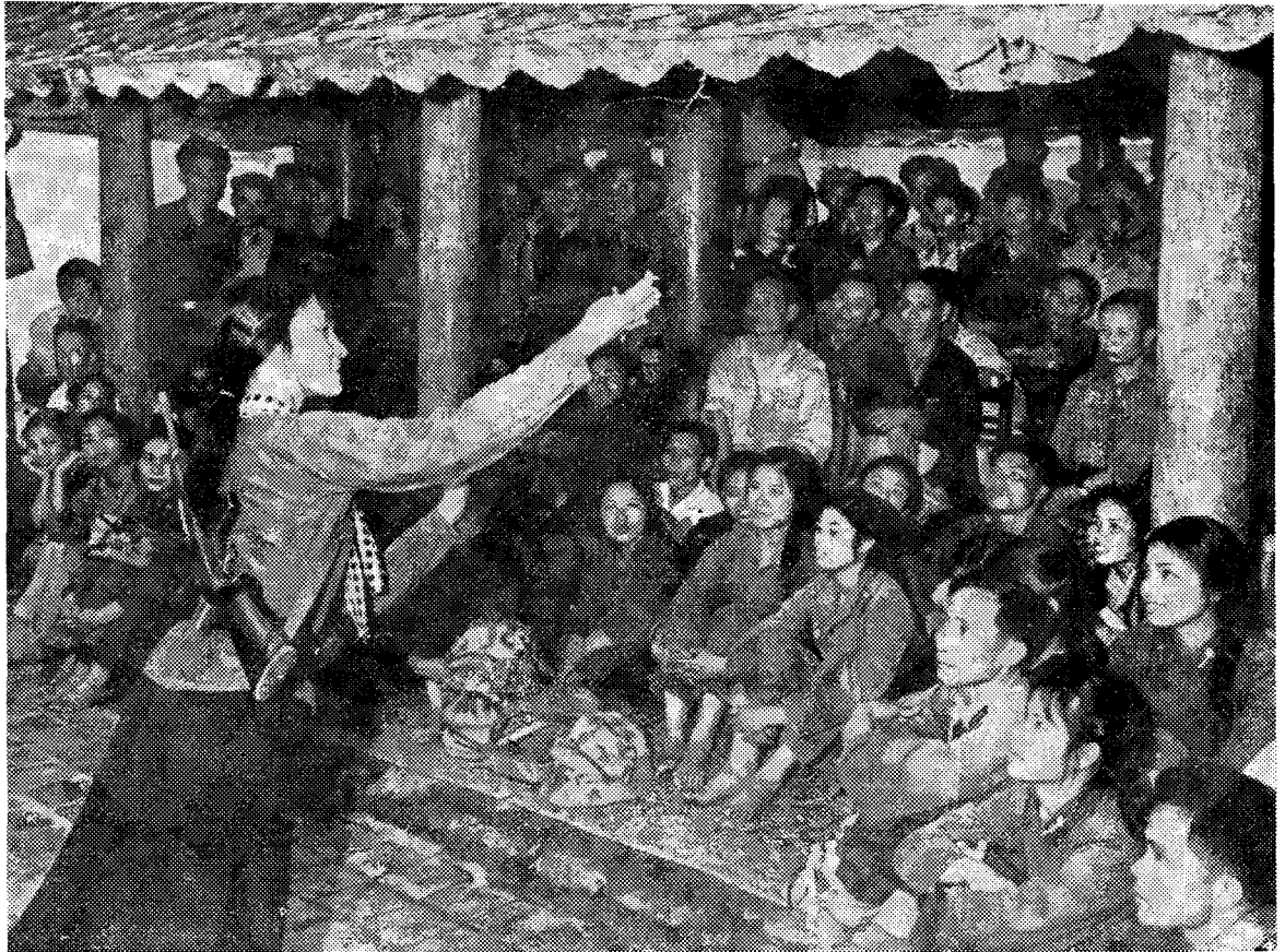
Taking with them the Chinese people's deep respects and fraternal wishes, artists of China's Dong Fang Ensemble have been to entertain the heroic Vietnamese people battling in the forefront of the struggle against U.S. imperialism. Wherever they went, they were greeted by the Vietnamese fighting men and people with cheers of "Long live the solidarity and militant friendship between the Vietnamese and Chinese peoples!" Our photo taken in President Ho Chi Minh's native town in Nghe An Province shows an actress of the ensemble in a programme reflecting the heroism of the Vietnamese women during the struggle to resist U.S. aggression and save their country.