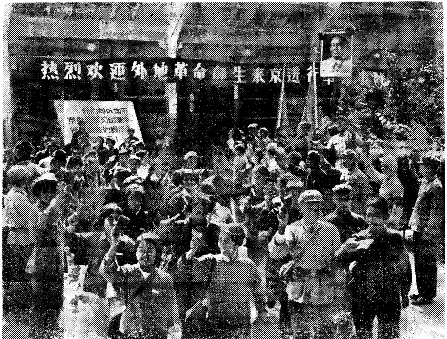
At Peking’s Yungtingmen Railway Station — revolutionary students and teachers come to exchange experience wave to their welcomers

In Szechuan’s Apha Tibetan Autonomous Chou , a region of snow-capped mountains and grasslands, animated gatherings were held in many places by revolutionary students and teachers of various nationalities. Many young Tibetan Red Guard fighters recalled in their speeches that in the time of the Red Army, many of their fathers and brothers had followed Chairman Mao in making revolution. They said that they would march along the path blazed by the Red Army, and, like their fathers and brothers, would always warmly love Chairman Mao and the Party, and follow him in revolution throughout their lives.