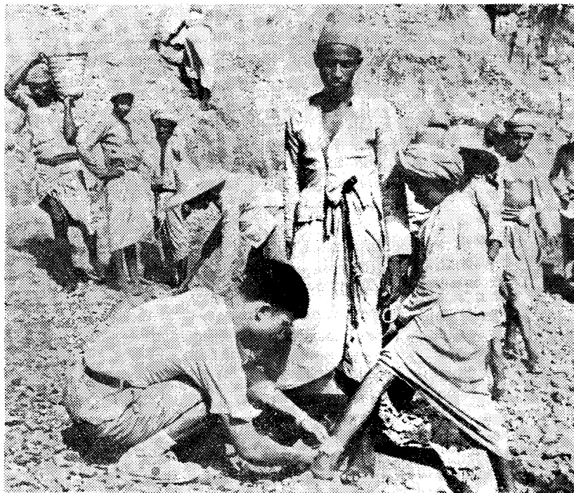
A medical worker of the Chinese experts group giving first aid to a Yemeni worker at a Yemeni highway construction site

"The Chinese experts are good because Chairman Mao has taught them well" is a very popular saying