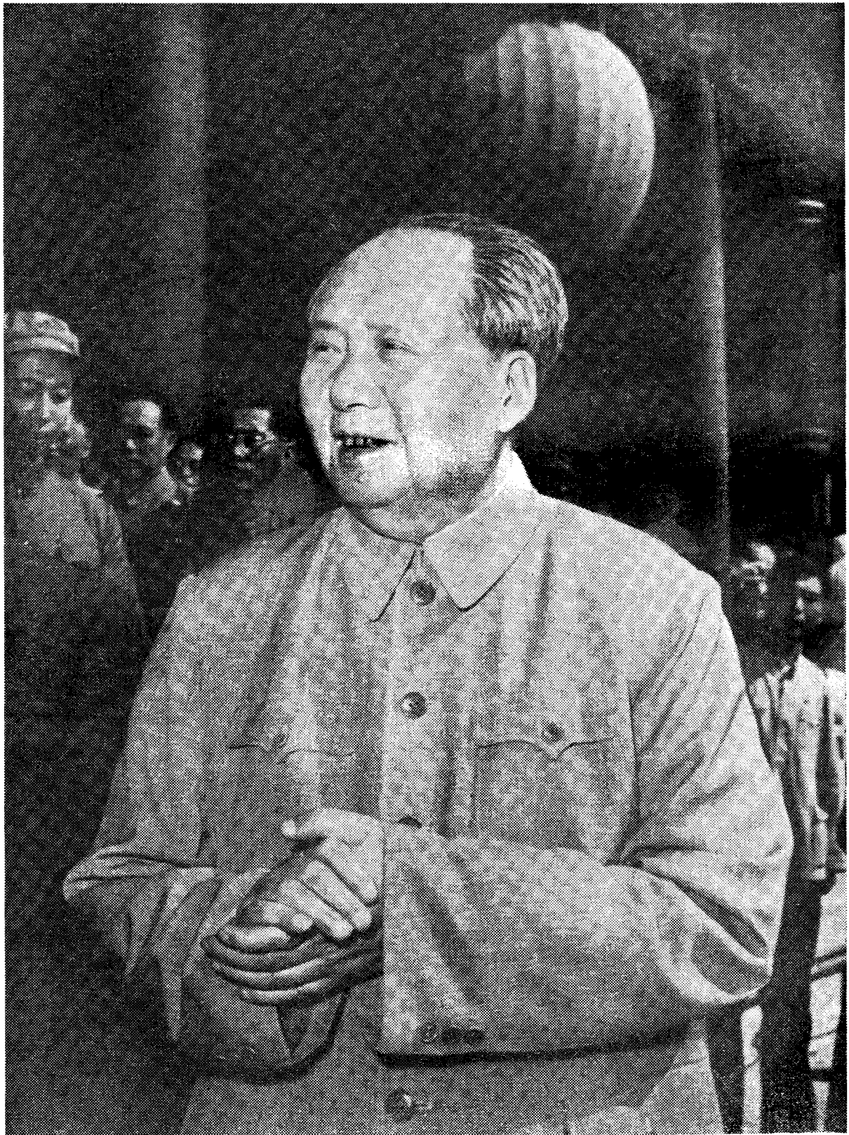
On October 1, our great teacher, great leader, great supreme commander and great helmsman Chairman Mao Tse-tung reviews the marching columns of the National Day parade from the Tien An Men rostrum