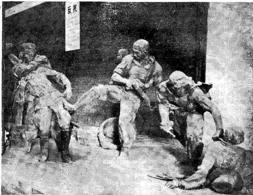
New figures in Rent Collection Courtyard : The awakened peasants in organized and well-led resistance seize arms from the landlords' guards

The compound was an arena of class struggle. It was a focal point of confrontation of the exploiter and the exploited, the oppressor and the oppressed. It was a gateway of life and death. The process of collecting rent in the courtyard was no simple business transaction. It was a process of the landlord class economically exploiting and politically oppressing the peasants. Class struggle was the very essence while paying and collecting rent was only a phenomenon. This was the "key."