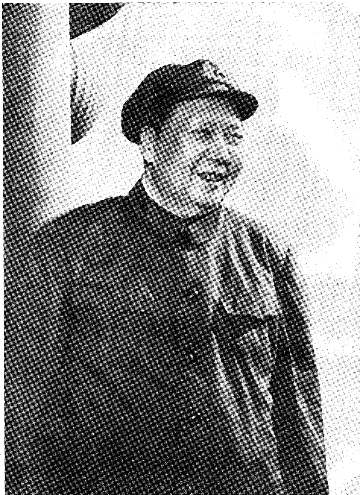
Chairman Mao Tse-tung, our great teacher, great leader, great supreme commander and great helmsman, on the Tien An Men rostrum reviewing revolutionary students and teachers and young Red Guard fighters