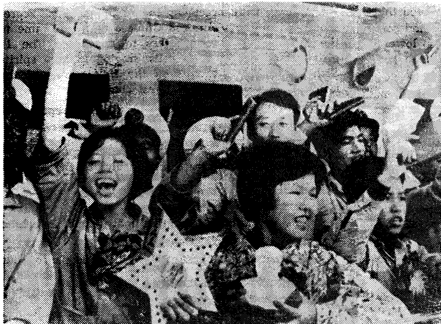
The overseas Chinese youths with a bust of Chairman Mao, their 5-pointed star, and copies of Quotations From Chairman Mao Tse-tung arrive at Chankiang port after a courageous and successful struggle against the Indonesian reactionaries.

They sang this repeatedly in the struggle, to express their infinite love for their most respected and beloved great leader Chairman Mao and the great motherland, and their boundless loyalty to the great thought of Mao Tse-tung.