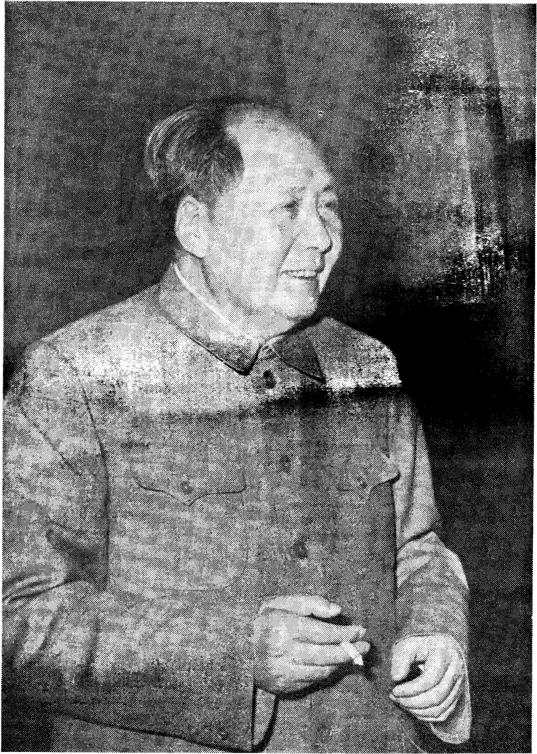
Chairman Mao Tse-tung

Our great teacher, great leader, great supreme commander and great helmsman