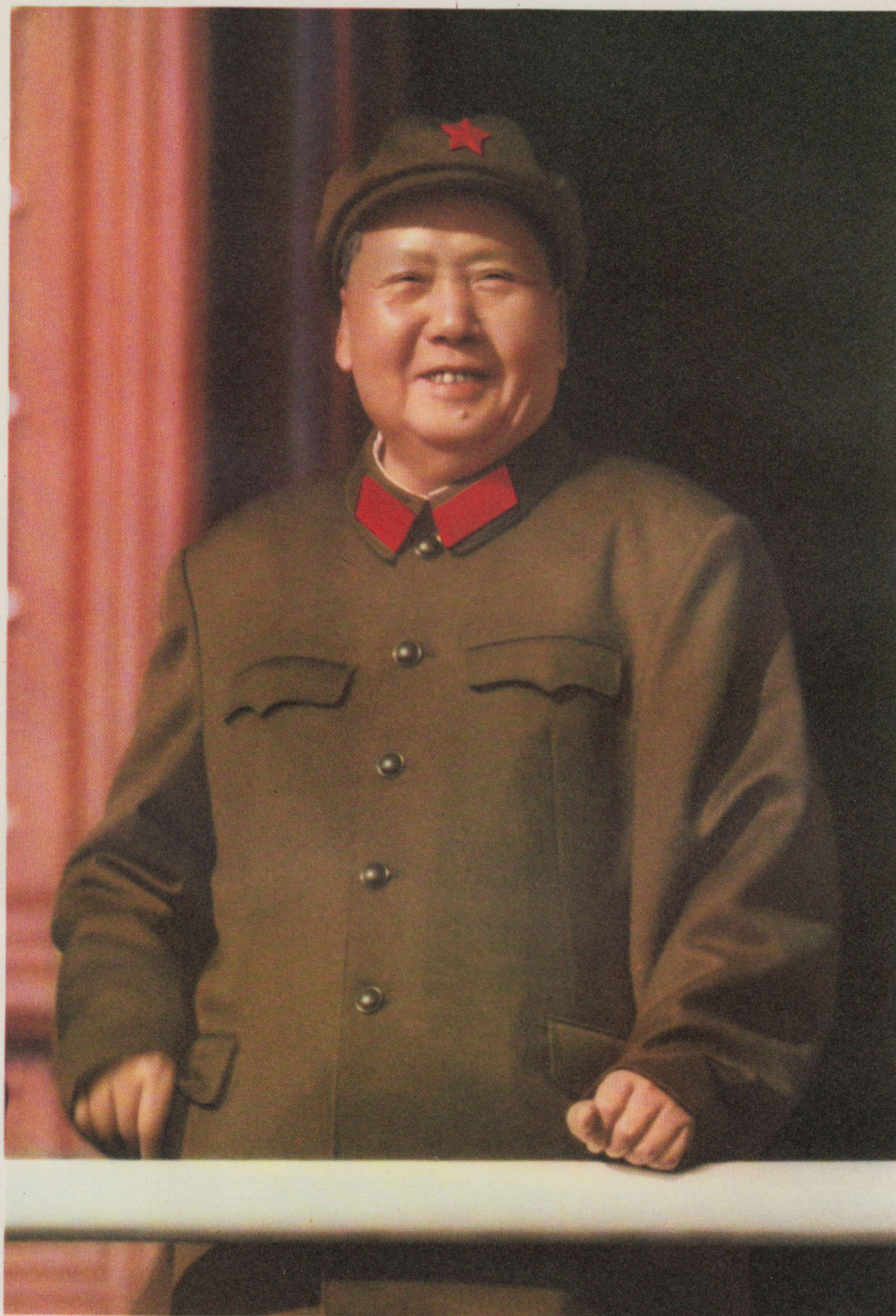
Chairman Mao Tse-tung

Our great teacher, great leader, great supreme commander and great helmsman