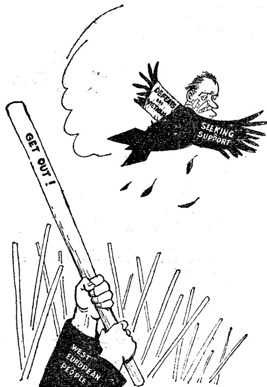
Fly away, Humphrey! Cartoon in "Renmin Ribao"

U.S. imperialism has always tried to deceive the American people with the lie that its policy towards Vietnam has wide "understanding" and "sympathy" around the world. How-