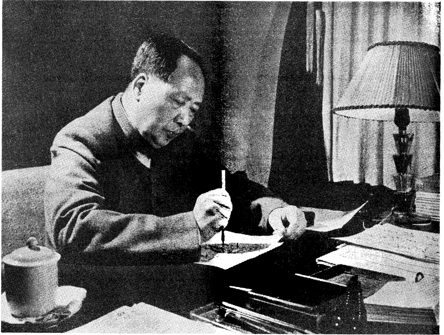
Chairman Mao Tse-tung

Our great teacher, great leader, great supreme commander and great helmsman