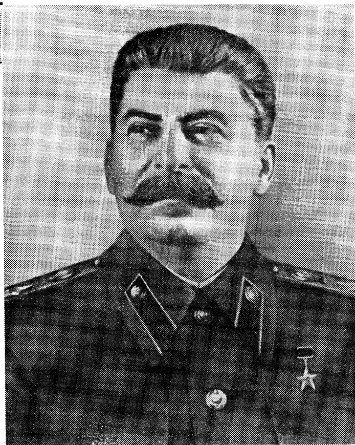
Stalin - the great Marxist-Leninist

the Soviet Union has become the centre of modern counter-revolutionary revisionism and another headquarters of the world's reactionary forces.