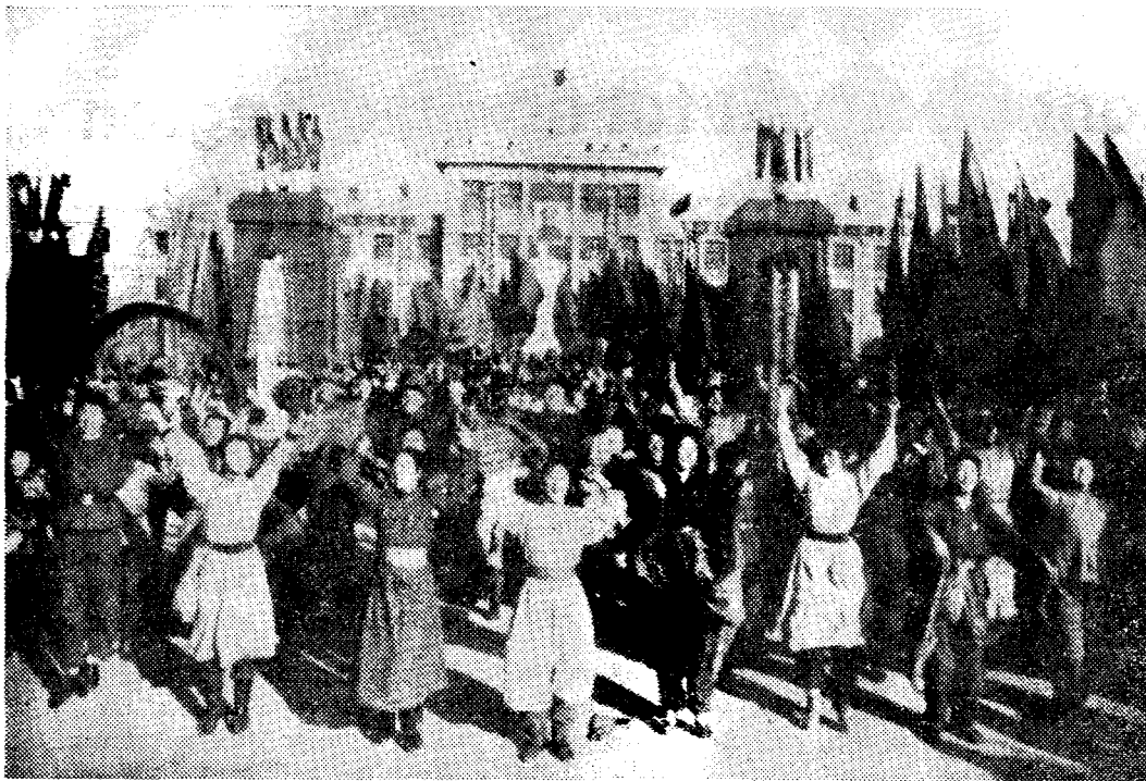
When the Revolutionary Committee of the Inner Mongolian Autonomous Region is established, the revolutionary masses of various nationalities celebrate in Huhehot.

Answering Chairman Mao's great call to " grasp revolution and promote production " and stimulated by the upsurge in the great proletarian cultural revolution, the people of Inner Mongolia have scored great successes in animal husbandry and reaped a good harvest this year. Industrial production also grows steadily.