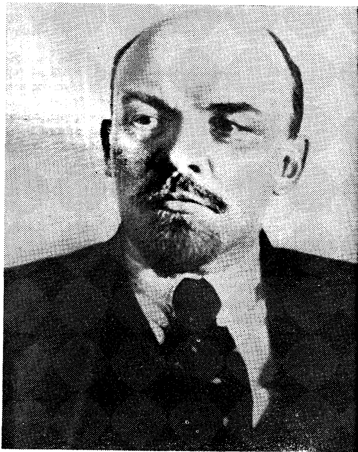
Lenin - the great teacher of the proletarian revolution

After Stalin's death, the Khrushchov revisionist group usurped the Party and state leadership, betrayed the October Revolution, betrayed Lenin and caused the socialist Soviet Union to change its political colour. Today, under the reactionary rule of Brezhnev, Kosygin and their ilk,