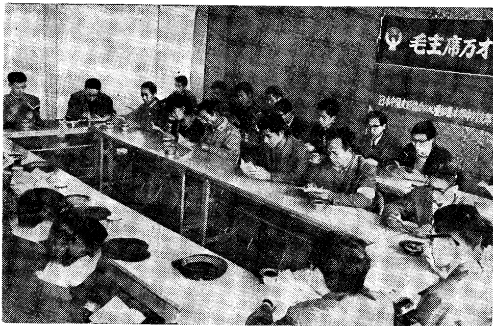
Members of the Japan-China Friendship Association (Orthodox) in Aichi Prefecture, Japan, studying Quotations From Chairman Mao Tse-tung.

In conclusion, they read aloud in unison three times Chairman Mao's quotation: "Be resolute, fear no sacrifice and surmount every difficulty to win victory." They raised their fists and shouted enthusiastically, "Long live Chairman Mao!" "May Chairman Mao, the red sun in our hearts, live a long, long life!"