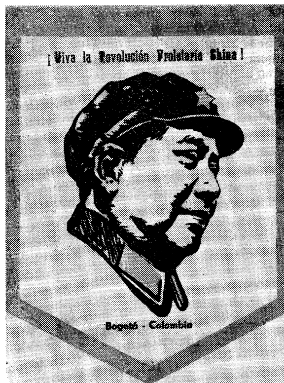
Latin American revolutionaries are determined to learn from the Chinese Red Guards' spirit of revolutionary rebellion and disseminate the brilliant thought of Mao Tse-tung throughout the continent. This Red Guard armband, on which the portrait of the great helmsman Chairman Mao is printed, was made by Colombian revolutionary youth.

Through their own practice in struggle, Latin American revolutionary political Parties and organiza-