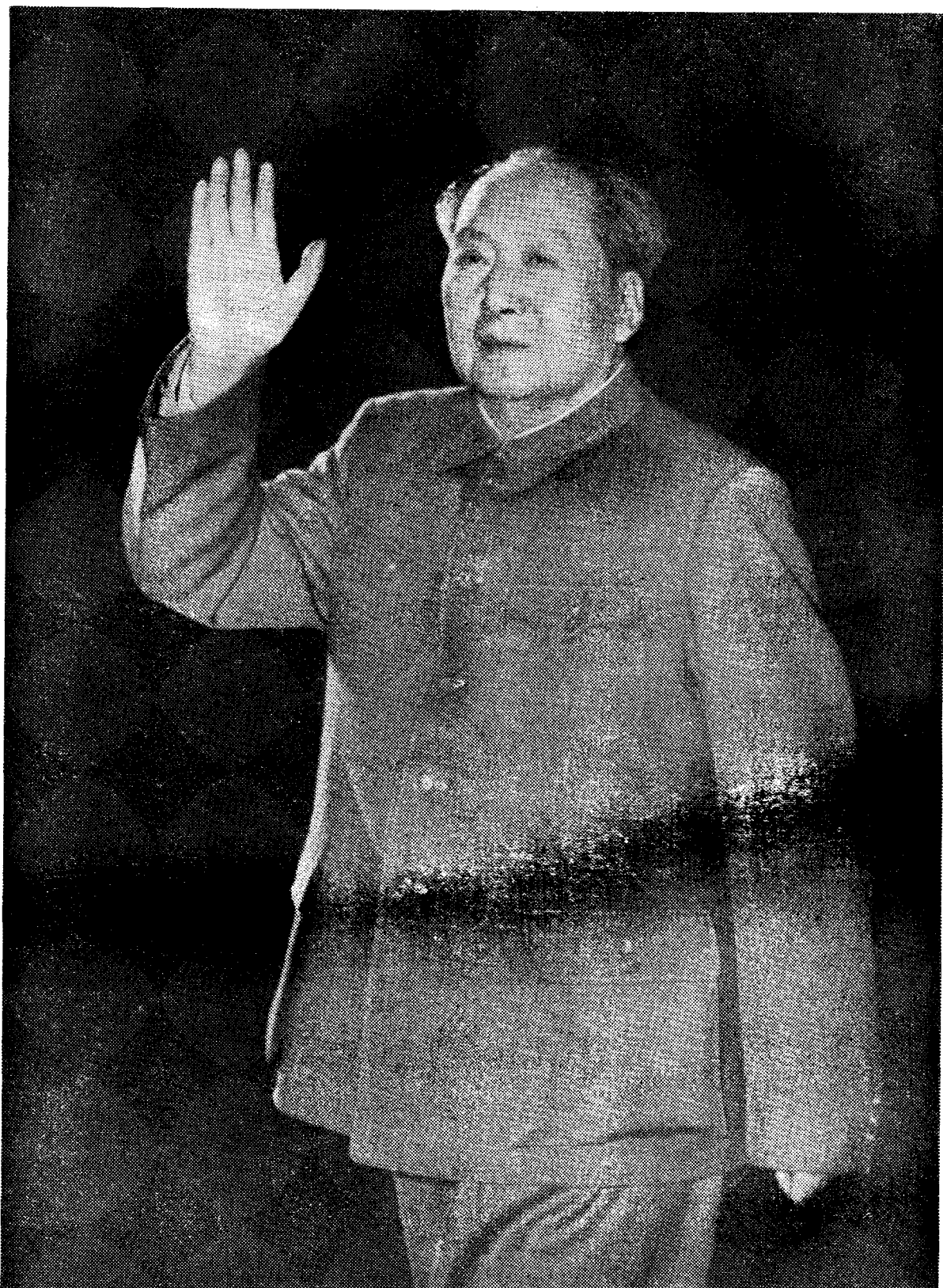
Our great teacher, great leader, great supreme commander and great helmsman Chairman Mao and his close comrade-in-arms Vice-Chairman Lin Biao on February 19 received P.L.A. representatives who have rendered new distinguished service during the great cultural revolution. Chairman Mao waves to the revolutionary fighters from the rostrum of the Great Hall of the People.