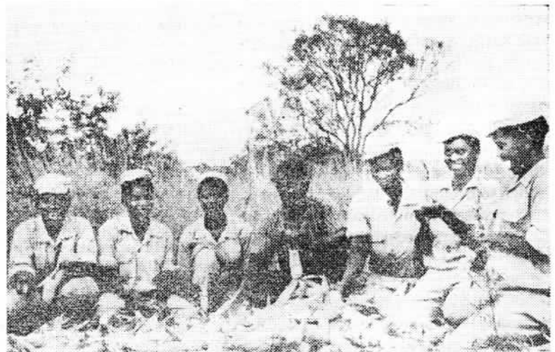
Joyful Mozambique guerrillas with maize they have grown. The guerrillas also engage in production.

The great leader Chairman Mao has taught us: "A nation, big or small, can defeat any enemy, however powerful, so long as it fully arouses its people, firmly relies on them and wages a people's war." The Mozambique patriotic fighters understand very well that they are not only confronting Portuguese colonialism but also vicious U.S. imperialism. Therefore, they know they should not cherish any illusions about easy victory. The struggle is a protracted and arduous one. Nevertheless, they have stressed that even if their struggle for liberation should last 20 or 30 years, they are determined to carry it through to final victory.