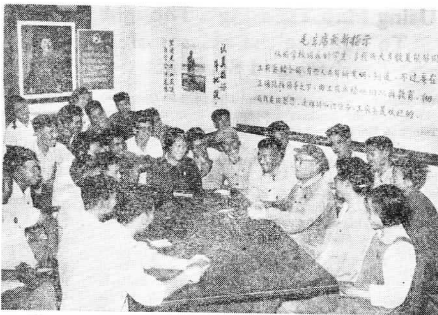
Members of the workers' Mao Tse-tung's thought propaganda team in Tsinghua University discuss Chairman Mao's latest instructions with revolutionary students and teachers.