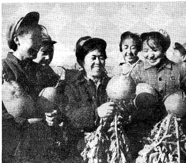
Women students of the Liuho "May 7" Cadre School joyfully harvest the large turnips they have grown, deeply appreciating the truth that labour creates social wealth.

Chairman Mao teaches us: "This change in world outlook is something fundamental." In order to dig up the roots feeding revisionism among cadres, the fundamental thing is to remould their world outlook. Therefore, from the day it was founded, the "May 7" Cadre School set itself, as a matter of prime importance, the task of remoulding its students' world outlook.