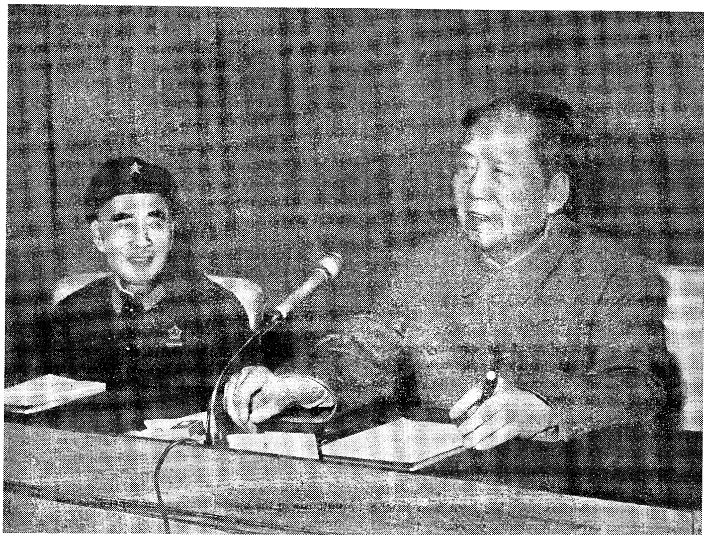
Our great leader Chairman Mao and his close comrade-in-arms Vice-Chairman Lin Piao at the Enlarged 12th Plenary Session of the Eighth Central Committee of the Communist Party of China.

Chairman Mao is making a most important speech.