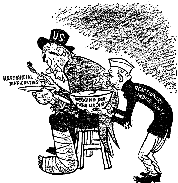
Master and Slave

The food shortage and the awakening of the Indian peasants are harbingers of a new revolutionary storm on a larger scale.