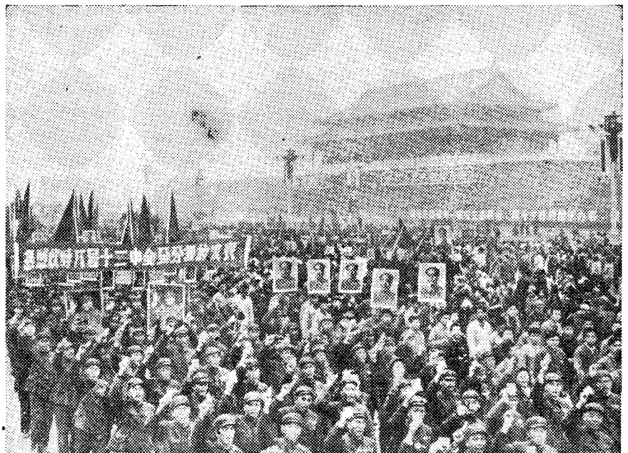
The publication of the Communiqué of the Enlarged 12th Plenary Session of the Eighth Central Committee of the Party has inspired China's hundreds of millions of armymen and civilians. In the past few days, they have held many celebration parades. These are paraders in the capital, Peking.