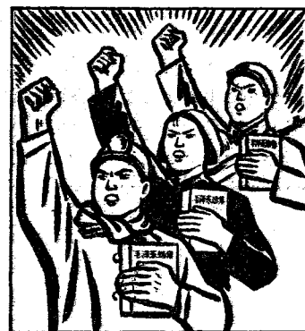
WORKERS, PEASANTS, SOLDIERS ON WORLD AFFAIRS

Referring to the reactionaries in all countries, our great leader Chairman Mao has said that "in the final analysis, their persecution of the revolutionary people only serves to accelerate the people's revolutions on a broader and more intense scale." The revolutionary flames of the peasant struggle kindled in Naxalbari in January last year are now spreading over the vast land of India. This struggle has shown the rest of the Indian people the road of advance. We, the people of Lankao, deeply sympathize with the Indian people and firmly support their struggle. The day will come when the broad masses of the Indian working people will smash their chains and put an end for good to the criminal rule of the U.S.-Indian reactionaries. We are convinced a bright future lies before them.