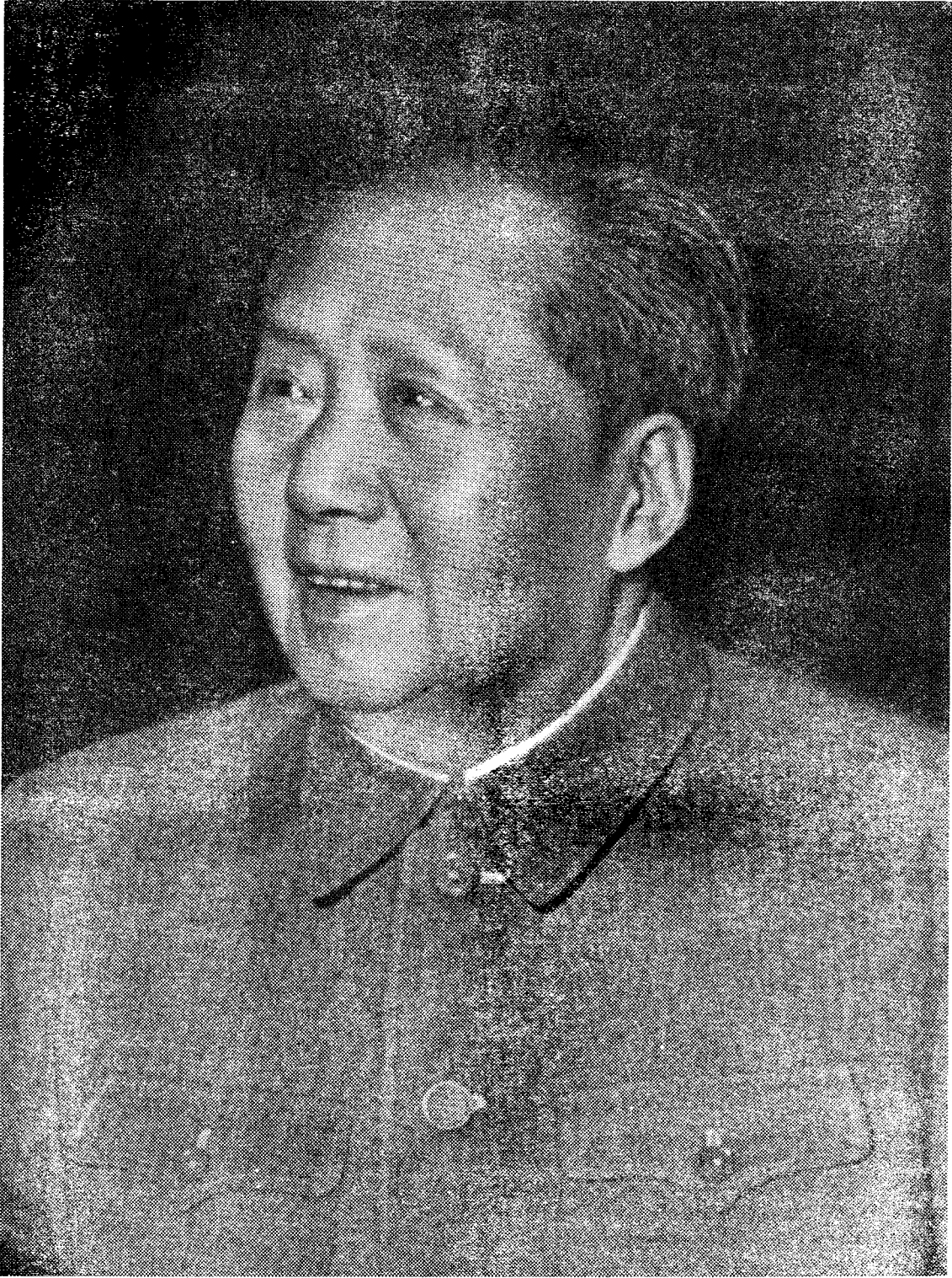
Our great leader Chairman Mao and his close comrade-in-arms Vice-Chairman Lin Biao received revolutionary fighters from all parts of China on January 25. With great pleasure and in high spirits, Chairman Mao met the revolutionary fighters.