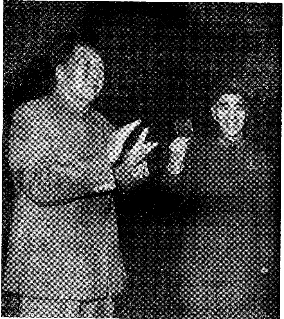
Our great leader Chairman Mao and his close comrade-in-arms Vice-Chairman Lin Piao affectionately greet the revolutionary fighters.

Among those who had the honour of being received were commanders and fighters of the Chinese People's Liberation Army and representatives of revolutionary cadres and revolutionary