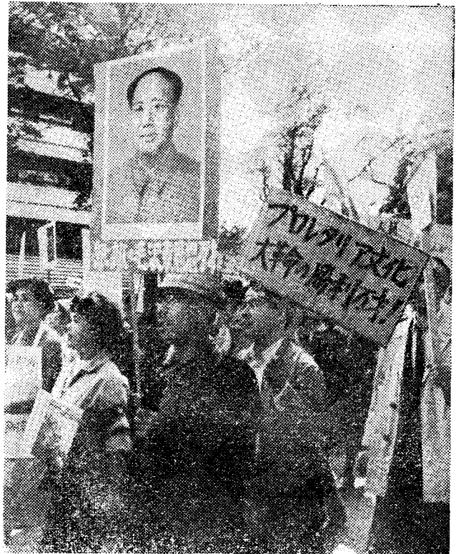
Holding aloft a portrait of Chairman Mao, the great leader of the Chinese people, and a placard with the words "Long live the victory of the great proletarian cultural revolution," Japanese people stage a demonstration.