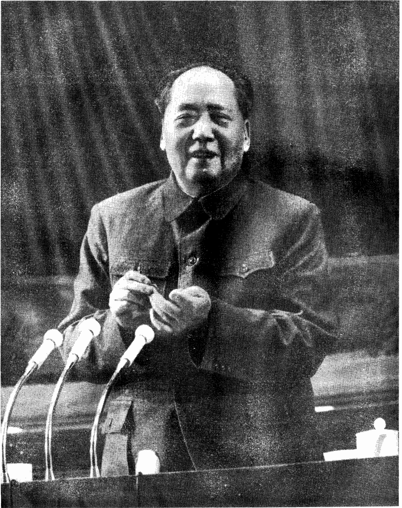
Our great leader Chairman Mao is making a most important speech at the Ninth National Congress of the Communist Party of China.