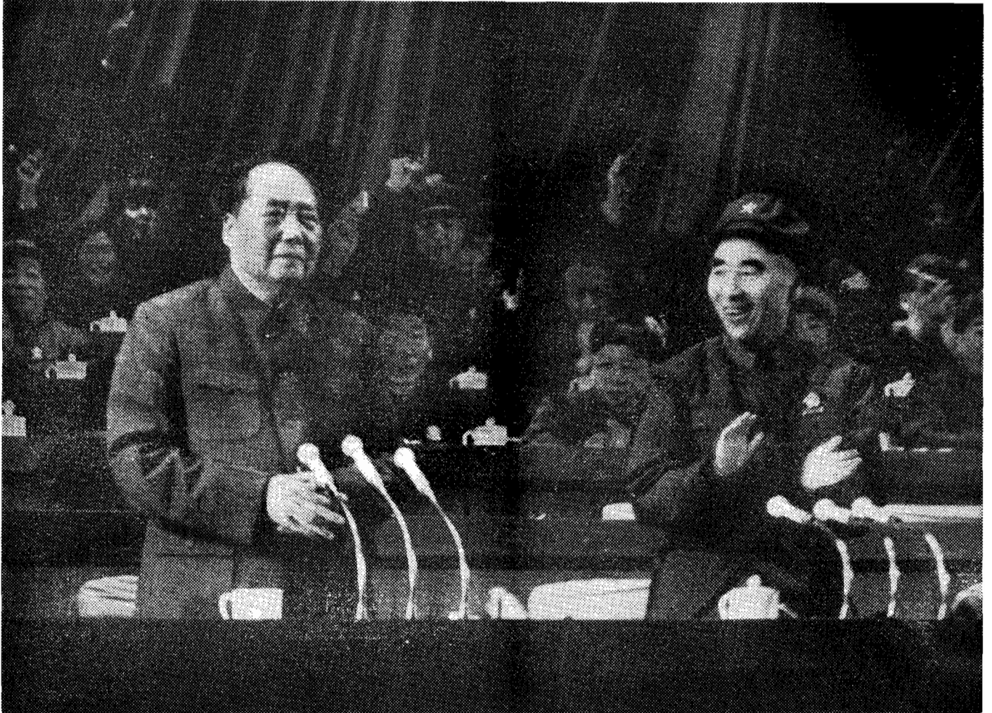
The great leader Chairman Mao and his close comrade-in-arms Comrade Lin Piao on the rostrum