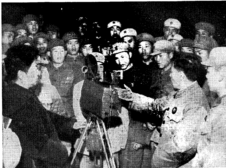
P.L.A. fighters think this new-type portable 8.75-mm. film projector is excellent.

This type of projector generally has a portable magic lantern and other attached equipments. Apart from showing films and lantern slides, it