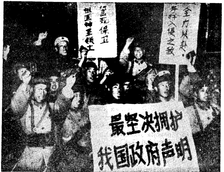
Frontier guards defending the Chenpao Island area demonstrate their firmest support for our Government's statement. They pledge to bring the revolutionary spirit of fearing neither hardship nor death into full play, heighten vigilance a hundredfold and be ready at all times to wipe out any enemy who invades.

The broad masses of army-men and civilians throughout the country unanimously pointed out: The Soviet revisionist renegade clique in its March 29 statement did everything possible to sow discord in the friendly relations between the Chinese and Soviet peoples, in order to sabotage their revolutionary friendship which had been formed over a long period of struggle. This will never succeed. The Soviet revisionist renegade clique is the common enemy of the Chinese and Soviet peoples. The Chinese people resolutely support the Soviet people in their just struggle to overthrow the new tsars and re-establish the dictator-