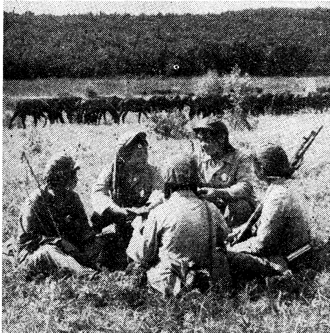
Members of the Ten Sisters Herding Squad discuss what they have gained in the living study and application of Chairman Mao's works on the grassland.

When capital construction work was finished, several hundred army horses arrived at the ranch.