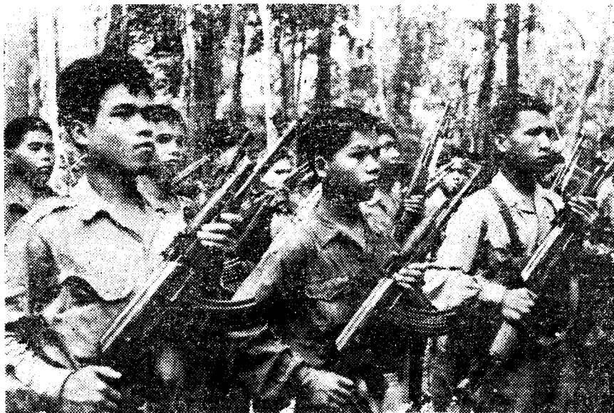
Fighters of the Cambodian People's National Liberation Armed Forces.

mocracy. Production in the liberated areas is developing quickly and the people's livelihood has improved. A thriving scene has appeared in the vast liberated areas which have become a strong base for the war against U.S. aggression and for national salvation.