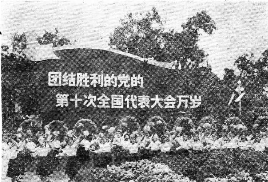
National Day holiday-makers in Peking hail the Tenth National Congress of the Chinese Communist Party.

The gala celebrations demonstrated the monolithic unity of the Chinese people of all nationalities under the leadership of the Party Central Committee headed by Chairman Mao. Taking part in the capital's garden parties were representatives of workers and commune members