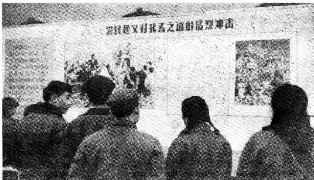
Part of Tsinghua University's exhibition on criticizing Lin Piao and Confucius.

The cadres and workers linked Lin Piao's restoration plot with the statements and moves of those in history who plotted a restoration of the old order and with the facts of class struggle in today's society and concluded that all were inseparable from the doctrine of Confucius and Mencius. Therefore, to prevent a capitalist restoration and to continue the