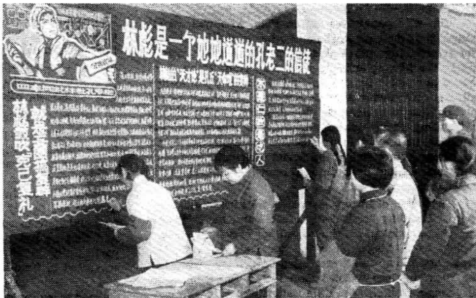
Workers at the Peking People's Printing House write criticisms of Confucius on a blackboard.

Confucius lived towards the end of the Spring and Autumn Period (770-476 B.C.) when slave uprisings were frequent because of the slave-owning aristocracy's harsh exploitation and oppression and when new, feudal relations of production were in the ascendant and unprecedented social changes were under way. A faithful running-dog of the slave-owning aristocracy, Confucius who had an ardent love for the dying slave society viewed the rising feudal system with extreme trepidation and great hatred. He abused the revolutionary actions of the rebelling slaves as "offending their superiors and creating havoc" and was consumed with hatred for the Legalists who were against the slave-owning system and advocated the rule of "law." He wandered from state to state offering his shoddy goods of "restraining oneself and restoring the rites and all under heaven will submit to benevolence," hoping that people would restrain their desires and act according to the rites of the slave system of the Chou Dynasty, i.e., "not to look at things, listen to things, say things and do things which do not conform to the rites."