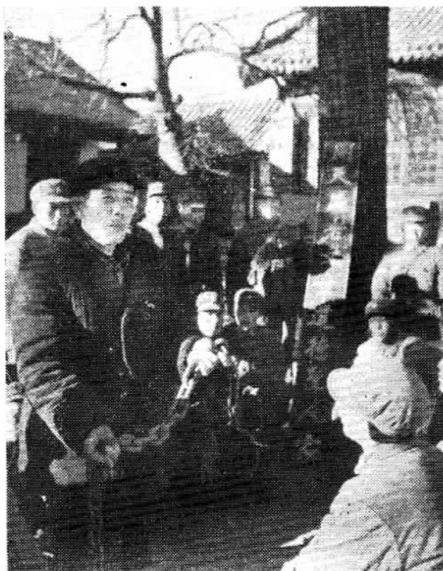
A former farm labourer of the "Kung Family" in Chufu County joins the P.L.A. men in criticizing Confucius. Showing a chain used by Confucius' descendants to suppress the labouring people, he angrily exposes the hypocrisy of Confucius' "benevolence and love."

In pre-liberation Hsilinhsi Village, 215 of the 220 peasant households bore the surname "Kung"; apart from 3 rich peasant and 15 middle peasant families, 147 families worked for the "Kung Family" as tenant-