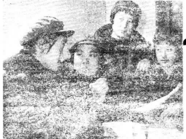
Women pilots of an air force unit writing articles criticizing Lin Biao and Confucius.

Since assuming leading responsibilities, these pilots have studied works by Marx, Engels, Lenin and Stalin