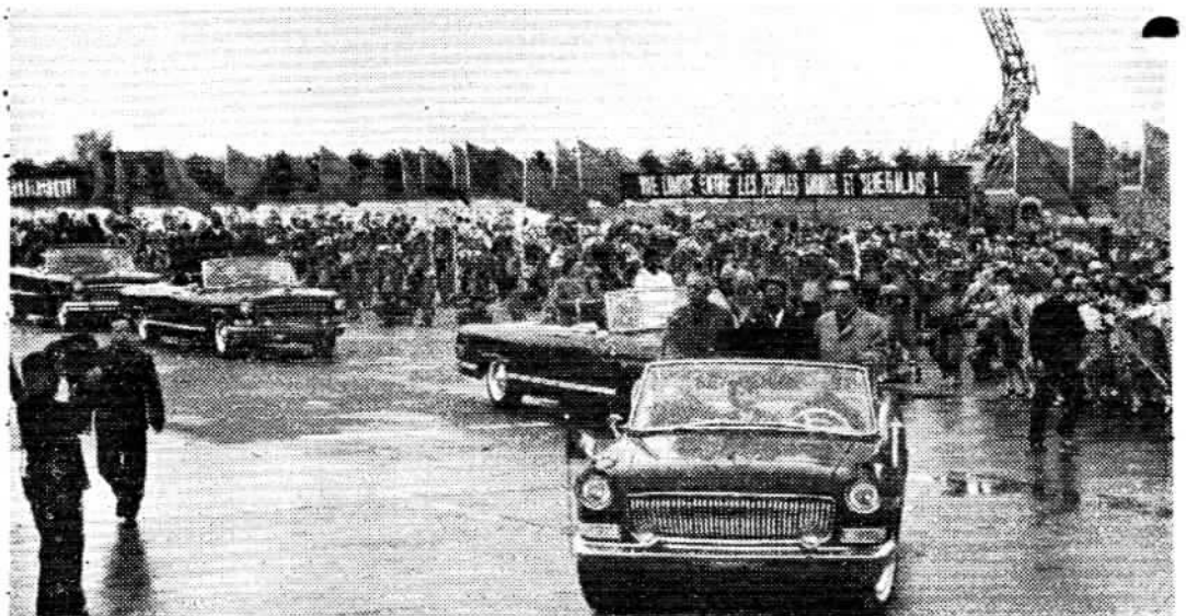
President Senghor receives a rousing welcome at the airport.

After the meeting, Premier Chou gave a grand banquet in honour of President and Madame Senghor. Premier Chou and President Senghor spoke at the banquet. (For ex-