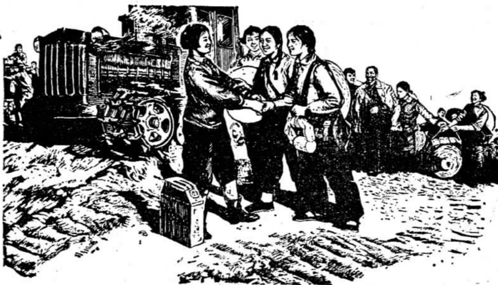
Educated youths settled in the countryside welcome new comrades-in-arms.

in our production team. Hsiao Huangfu was originally a small village surrounded on three sides by mountains and the ditch in front of it was muddy. The source of this ditch was a cave, known as "Dragon King's Cave," which was connected with an underground stream. The village was often flooded, especially in summer and autumn. Sometimes the water would suddenly gush from the cave on bright sunny days and the fields were inundated. The commune members tried to build a dam in front of the cave