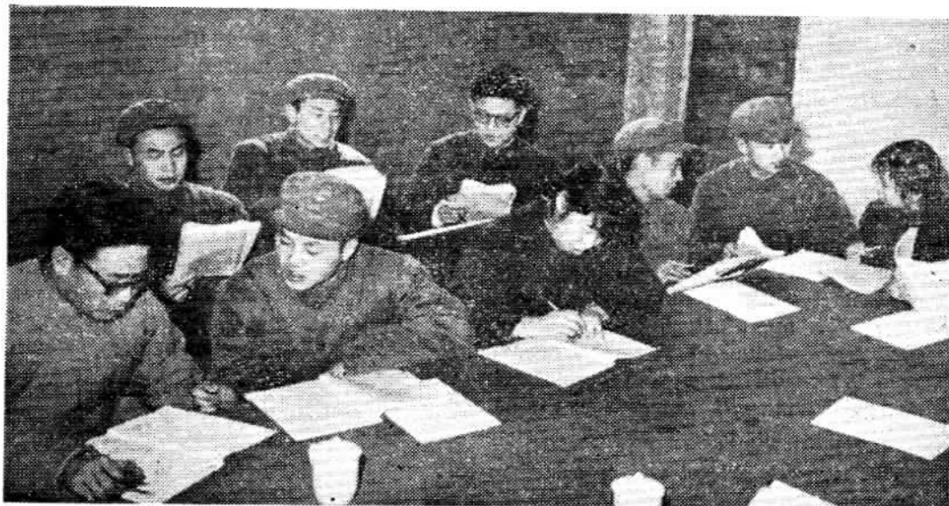
In preparing A Criticism and Annotation of the "Analects," worker-peasant-soldier college students canvass the opinions of the masses.