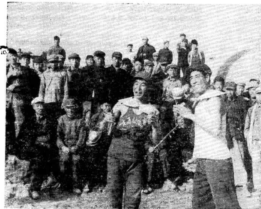
Peasant-workers singing quick-patter rhymes.

Another effective means to enhance the enthusiasm of the masses is to organize the peasant-workers to recall the misery and