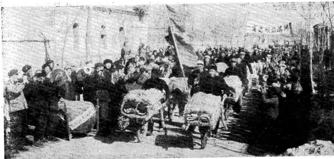
Commune members give peasant-workers leaving for the Haiho project a rousing send-off.

110 households out of the 130 or so lived by labouring for landlords. Every time there was a flood, which was quite often, the villagers dispersed—hence the name of the village was pronounced with a different intonation, meaning “Scatter” or “Disperse.”