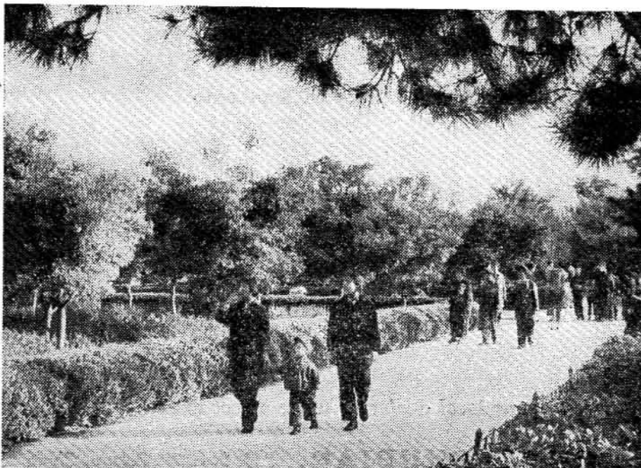
Fruit trees in Peking's Chungshan Park.

The British press showed an uneasiness in its comments on the situation. The Times said in an editorial: "The immediate crisis is bad enough, with the threat of a record degree of inflation and an almost unparalleled degree of depression." "A government with a tiny overall majority and less than two-fifths of the votes cast could not be expected to support on its own economic pressures perhaps worse than those of 1931," it added.