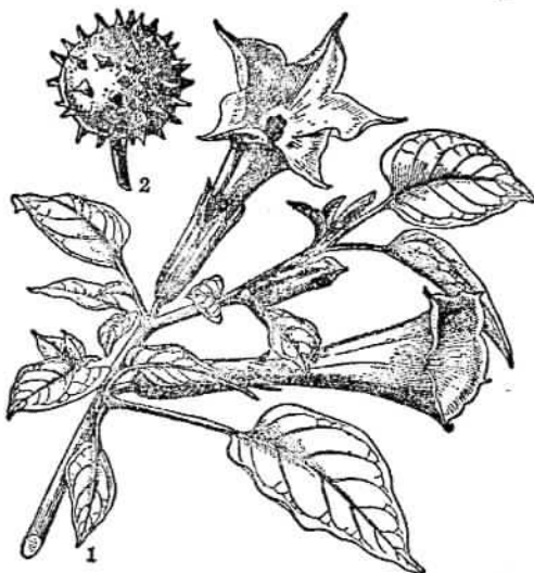
The datura flower. (1. branch, 2. fruit)

Certain shortcomings in this kind of anaesthesia remain to be overcome. Medical workers are continuing their research to improve it.