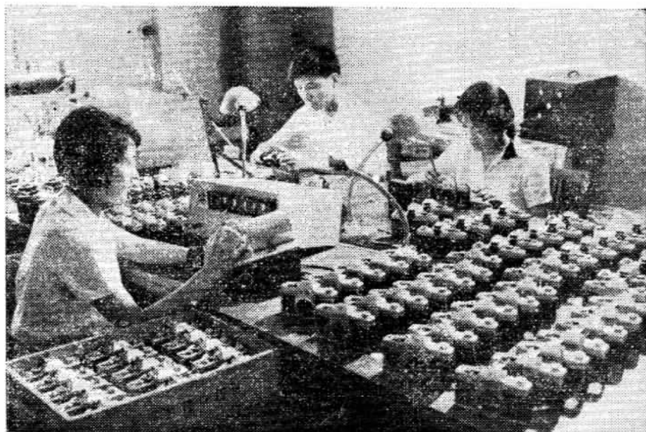
In an assembly shop of the Shanghai Camera Factory.

agriculture and light industry develop, heavy industry, assured of its market and funds, will grow faster. Hence what may seem to be a slower pace of industrialization will actually not be so low, and indeed may even be faster." ( On the Correct Handling of Contradictions Among the People. ) Guided by this principle, light industry in Shanghai and other places has developed at a fast pace.