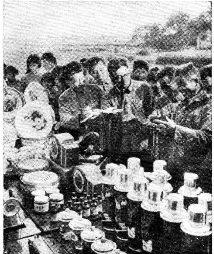
Members from production and commercial departments in Shanghai soliciting opinions from the peasants about the quality of the light industrial goods.

With the development of the national economy as a whole, the make-up of raw materials for China's consumer goods industry has undergone tremendous changes in recent years. For instance, two-thirds of the raw materials for Shanghai's light industry came from farm and rural side-line products in the early post-liberation days. As a result of building new branches of light industry and the growth of metallurgical, chemical, petroleum and other industries, two-thirds of the raw materials for the city's light industry now come from industrial sources. Though the proportion of raw materials from farm and rural side-line products has decreased, the absolute output value of Shanghai's light industrial goods using materials from these sources is three times the amount in the years immediately after liberation.