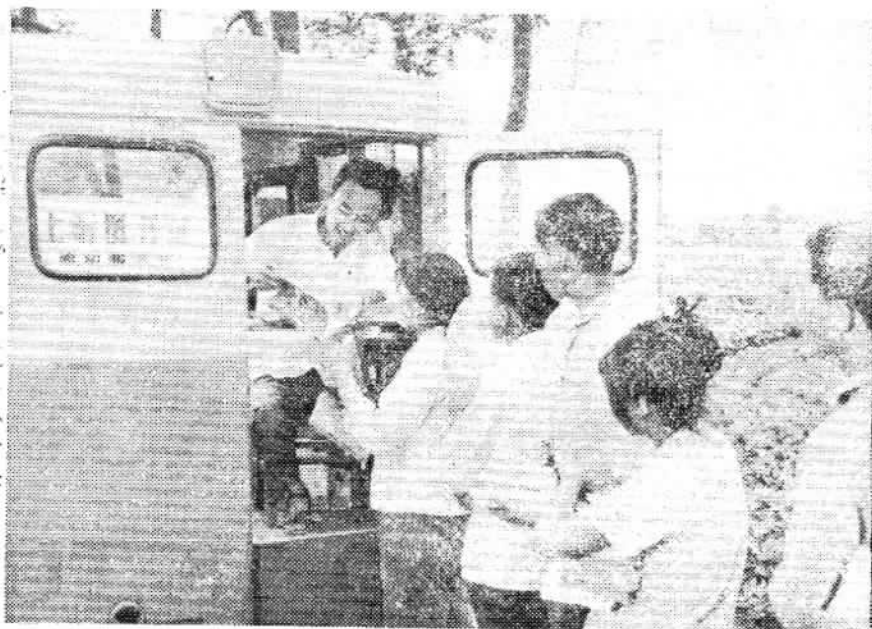
The Shanghai Library's mobile book-stall at a people's commune.

THE Shanghai Library, one of the biggest public libraries in China, accommodates four to five thousand readers a day from factories, rural people's communes and People's Liberation Army units.