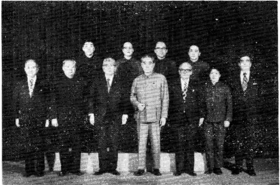
Premier Chou En-lai meets Member of the House of Representatives Shigeru Hori.

Shigeru Hori, Liberal-Democratic Member of the House of Representatives and former Minister of State of Japan, paid a friendship visit to China from January 15 to 21. Shinzo Tsubokawa and Seichi Tagawa,