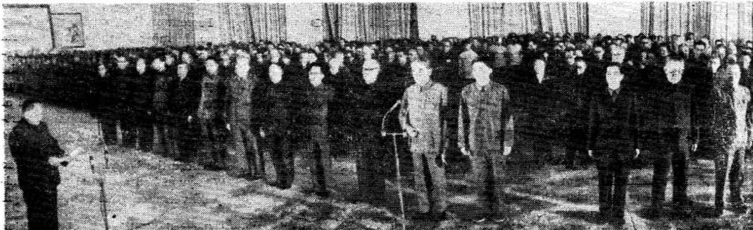
Comrade Teng Hsiao-ping makes a memorial speech at the ceremony.

Comrade Chou En-lai presided over the ceremony, which started with all those present standing in silent grief. Comrade Teng Hsiao-ping delivered a memorial speech.