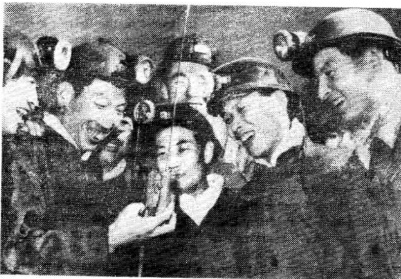
Miners of different nationalities in a Sinkiang mine listen to the happy news of the convocation of the Fourth National People's Congress.

Commanders and fighters in the Chinese People's Liberation Army