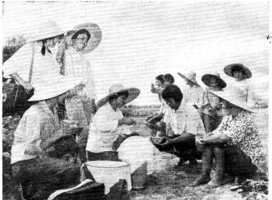
A barefoot doctor brings preventive medicine to the fields.

Nearly all these infectious diseases can be prevented. The People's Republic took immediate steps after its establishment in 1949 to treat and prevent various infectious diseases. Emphasis in the early