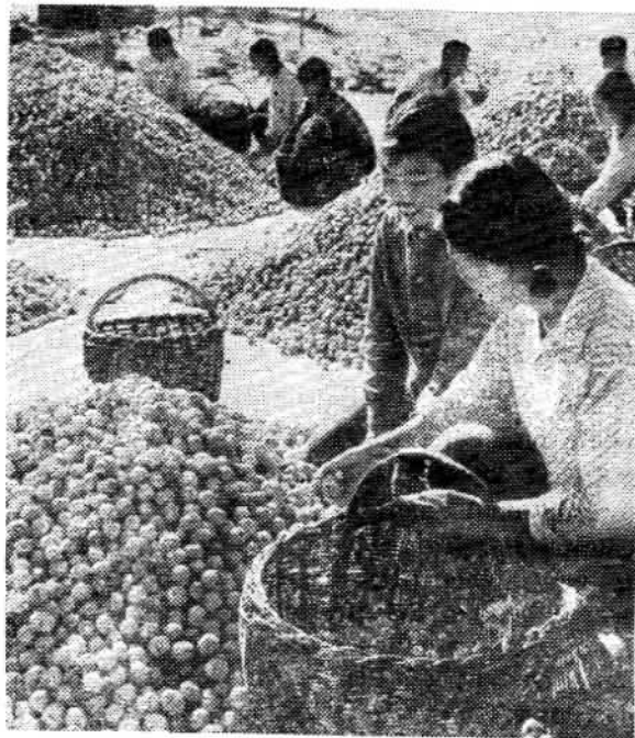
Good walnut harvest in a hilly area of Hopei Province.

Fighters in the Second Company of a P.L.A. Peking unit participate in lively literary and art activities such as play-acting, singing, painting and story-telling. In recent years they have put on more than 1,400 per-