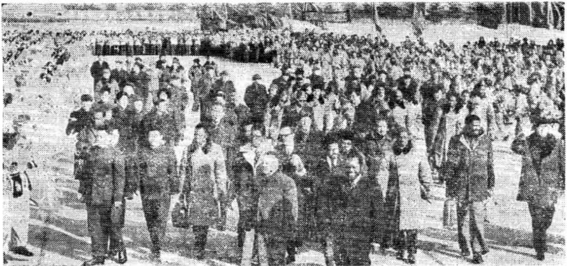
The Mozambique Friendship Delegation led by President Samora receives a rousing welcome at Peking Airport.

Vice-Premier Teng Hsiao-ping gave a grand welcoming banquet at the Great Hall of the People the same evening in the name of Premier Chou. Both Vice-Premier Teng and President Samora spoke at the occasion. (For excerpts of their speeches see pp. 13-15.)