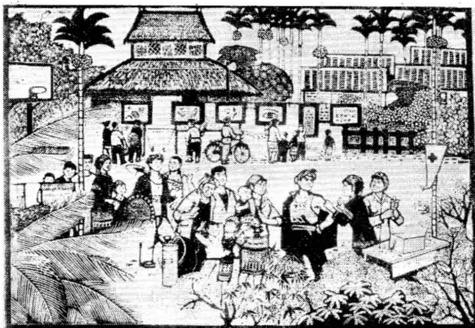
An anti-infectious disease team visits a hamlet of the Li nationality people on Hainan Island.

period was on highly contagious and serious diseases like smallpox, plague and cholera. Apart from vaccination and prophylactic inoculations, once a victim of these diseases was reported, he or she was isolated and given treatment to check any spreading. Within a short period, those diseases most harmful to the people's health had been wiped out throughout the country. Syphilis and gonorrhoea which were prevalent in old China rapidly declined in incidence after liberation and were later wiped out. As a result of mass health campaigns and the use of vaccines and prophylactic inoculations, the incidence of other infectious diseases has decreased markedly, and some have been brought under control.