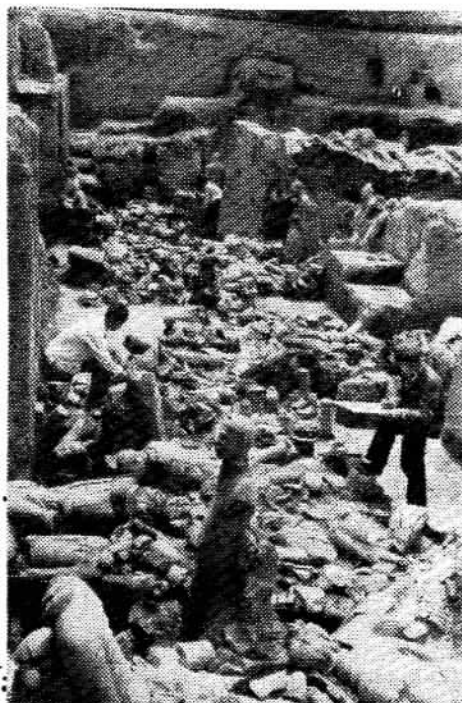
A view of the pit being excavated.

These life-size warrior and horse figures embody a sculptural art dis-