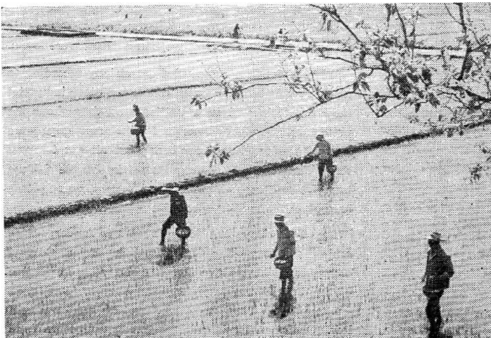
Peasants of Haian County spreading fertilizer in paddyfields.