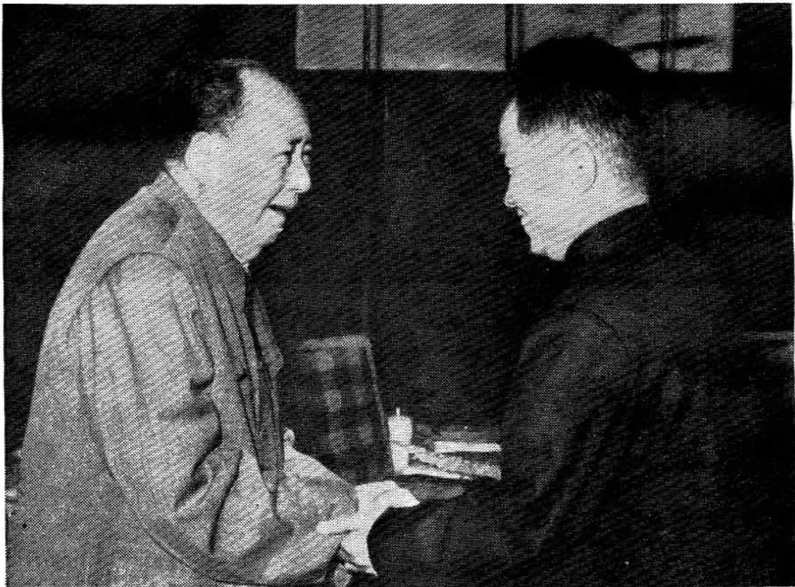
Chairman Mao Tsetung shaking hands with Deputy Prime Minister Khieu Samphan.