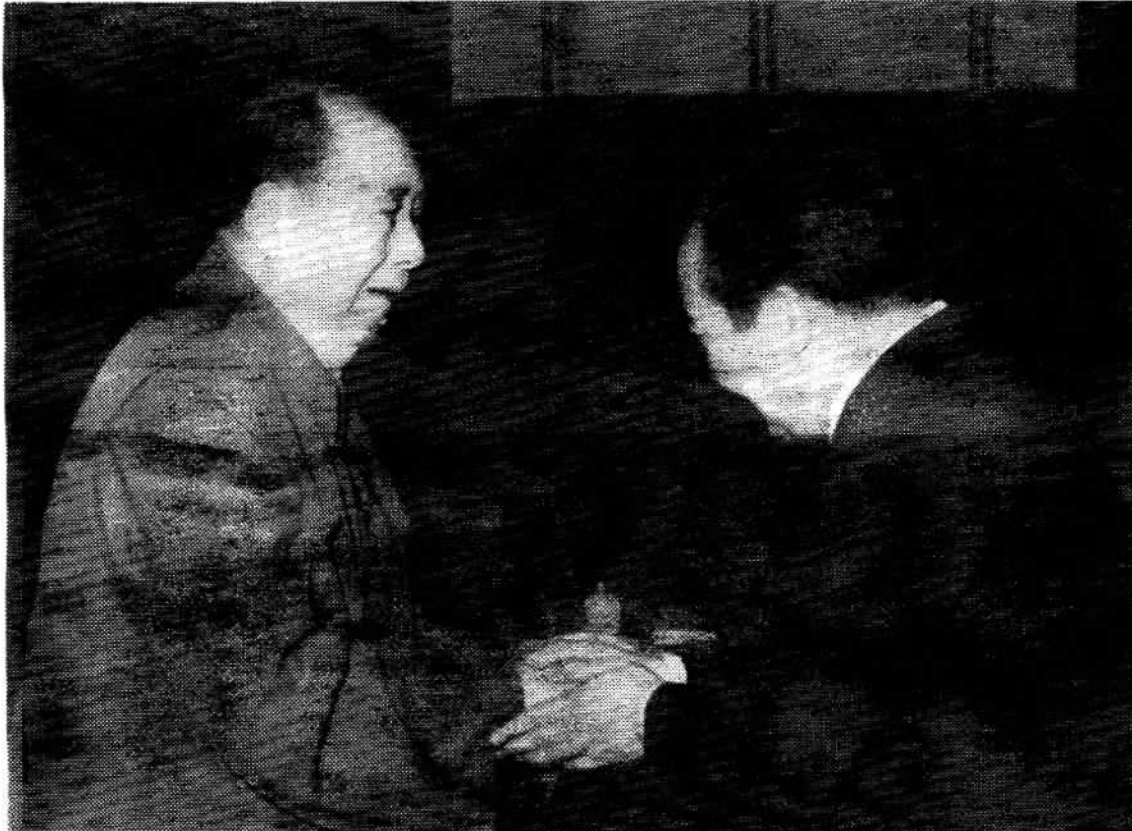
Chairman Mao Tsetung shaking hands with Samdech Norodom Sihanouk.

A cordial and friendly atmosphere prevailed throughout the meeting. Chairman Mao warmly praised the Cambodian people for daring to fight and win and achieving complete victory in their war for national