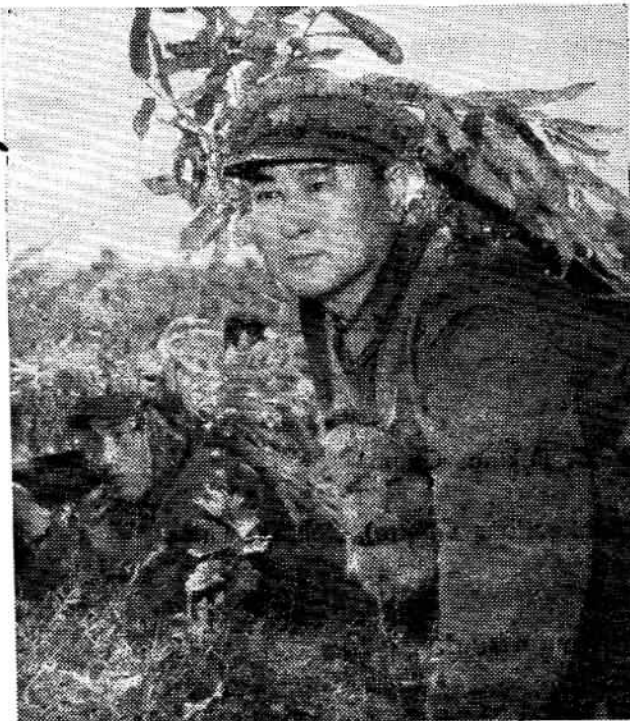
While serving as a soldier, a cadre takes part in military training.

Cadres going to companies and cadres and fighters of the grass-roots units have summed up the experiences gained by a number of companies during their study of the theory of the proletarian dictatorship, providing timely study guidance for all the Peking Units. As a result, many army units accomplished their plan for training, construction, production and barracks-building for the first half of this year ahead of schedule.