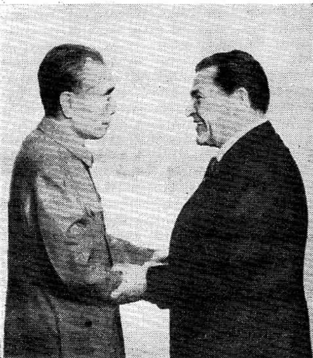
Comrade Chou En-lai meets Comrade Ilie Verdet.

The workers and staff of the complex held a big ceremonious