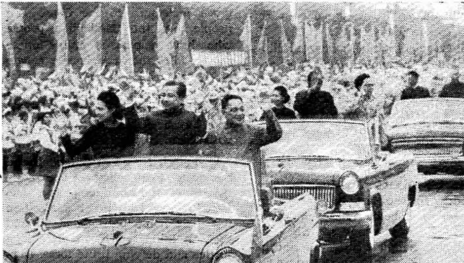
Distinguished Cambodian guests receive a warm send-off in Tien An Men Square.

Vice-Premier Teng Hsiao-ping gave a grand farewell banquet the same day in the name of Premier Chou En-lai. On behalf of Chairman Mao Tsetung, Chairman Chu Teh of the N.P.C. Standing Committee, Premier Chou En-lai and the Chinese Government and people, he extended hearty congratulations and bid a cordial farewell to Samdech Norodom Sihanouk and the other distinguished Cambodian guests. Both the Vice-Premier and Samdech Siha-