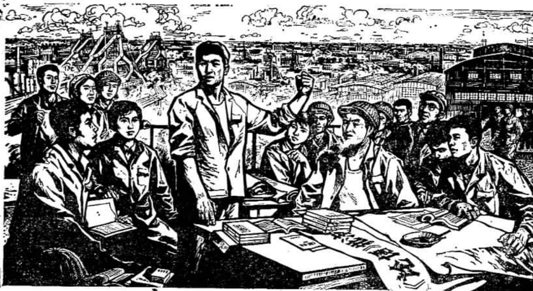
Workers' theoretical group criticizing the Confucian "classic" Analecets .

Why was Lin Piao's reactionary thinking so akin to that of Confucius? Chairman Mao has taught us: "What is perceived cannot at once be comprehended and . . . only what is comprehended can be more deeply perceived. Per-