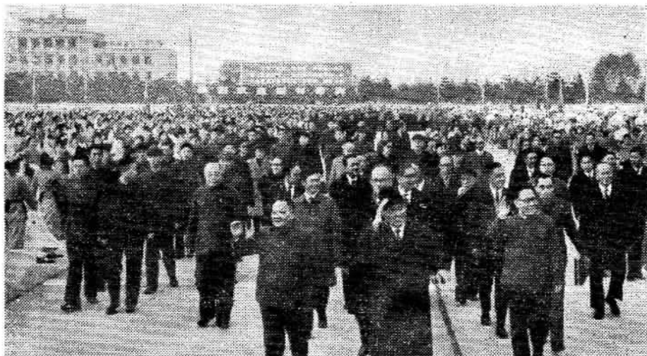
President U Ne Win warmly welcomed at Peking Airport.

Vice-Premier Teng Hsiao-ping said: "In the past few days, our two sides held sincere talks on questions of common interest. We are very glad to note that China and Burma hold common views on many questions. Both our countries sympathize with and support the numerous devel-