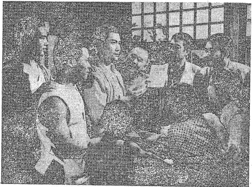
A shot from The Bright Road .

traversed by the oil workers. Undaunted in the face of the blockade imposed by imperialists and the perfidious acts of the Soviet revisionist