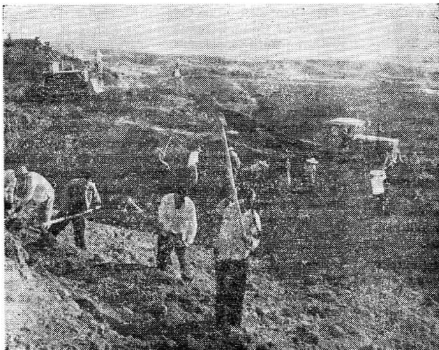
Members of the Nannao Brigade flattening hilltops for cultivation of crops.

cal change in the people. Take the womenfolk for example. During the Great Cultural Revolution they have been emancipated from the hearth and, as the other half holding up the sky, they have played their part in emulating Tachai. Farming for the revolution, they are not afraid of hard work and difficulties. They carry loads and pull carts, reclaim land and handle explosives; they can do anything that needs doing. They take the lead in breaking with old customs and habits. Weddings are no longer extravagant affairs. They are enthusiasts for planned births.