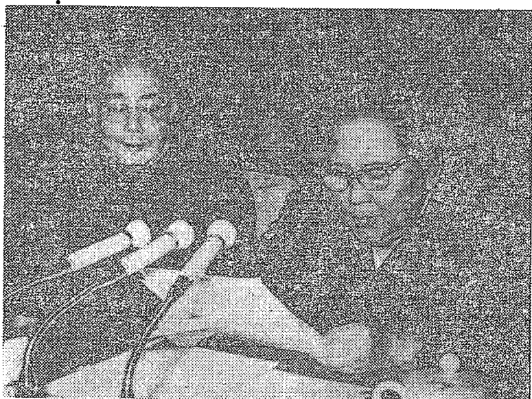
Vice-Chairman Soong Ching Ling presiding over the meeting.