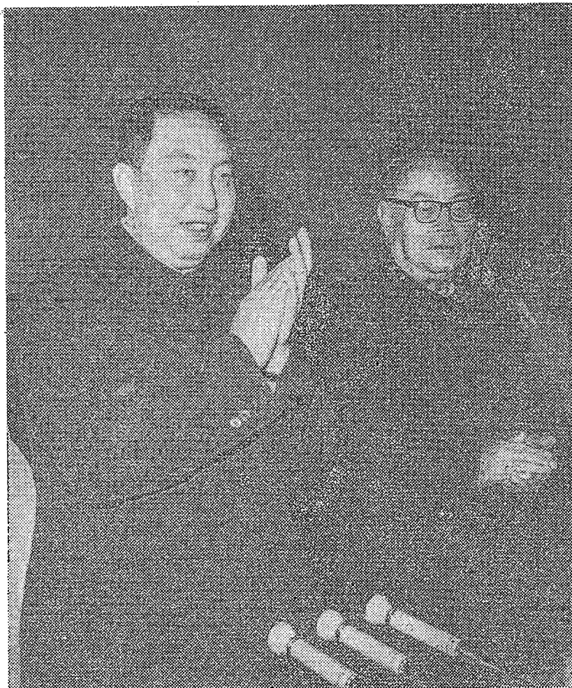
Chairman Hua Kuo-feng and Vice-Chairman Yeh Chien-ying.

Vice-Chairman Teng Ying-chao spoke at the meeting. She said: Shortly after we had been plunged into immense grief and anxiety by the loss of our great leader and teacher Chairman Mao Tsetung, we were greeted by two gratifying happy events for the people of all nationalities throughout China and for the revolutionary people of the world as well: We once again have, in Chairman Hua Kuo-feng, our wise leader; the Party Central Committee headed by Chairman Hua smashed at one stroke the anti-Party "gang of four," which is a great victory of far-reaching historic significance. This fully shows that Chairman Mao made a wise decision in choosing his successor. It amply proves that Chairman Hua is of great proletarian mettle and has far-sightedness and tremendous courage and wisdom, is prompt and resolute in making decisions and handles matters appropriately. It manifests his talent as a leader as well as his revolutionary style of work. I hereby express my heartfelt and high esteem and resolute support for Chairman Hua Kuo-feng. Having eliminated the "four pests," the Party Central Committee headed by Chairman Hua Kuo-feng is more united and enjoys