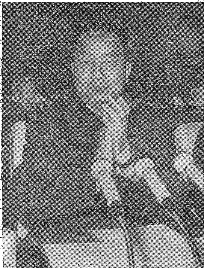
Chairman Hua Kuo-feng on the rostrum.

T HE Third Session of the Standing Committee of the Fourth National People's Congress of the People's Republic of China was held ceremoniously in the Great Hall of the People in Peking from November 30 to December 2.