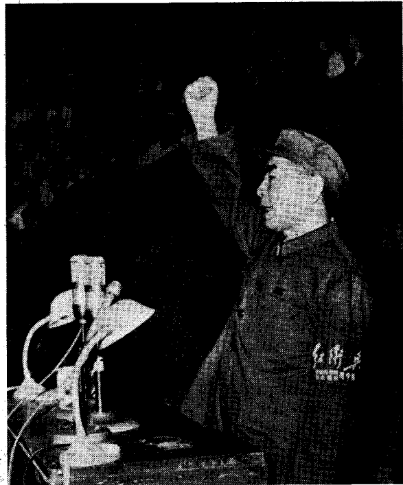
Premier Chou addressing a mass rally during the Great Cultural Revolution.

Amid the storm and stress of the Cultural Revolution, the great Red Guard movement sprang up. Chairman Mao warmly backed this revolutionary creation and in the short period of a few months he reviewed more than 10 million Red Guards from all over the country on eight occasions. When wave upon wave of millions of Red Guards poured into Peking, they found clothing, food, accommodations, transport and medical facilities available. Premier Chou had seen to that for he cherished these youngsters. When Chairman Mao invited Red Guards to move into and live in Chungnanhai, Premier Chou went in person to visit each and every room. Every time Chairman Mao reviewed the Red Guards, Premier Chou was there to oversee the arrangements so that this tremendous historic event was a complete success. In guiding the young revolutionaries to take the proletarian revolutionary path, Premier Chou constantly met group after group of Red Guards, talked with them long into the night, extolled their revolutionary spirit of daring to think, to speak out and to act, encouraged them to carry the Great Cultural Revolution through to the end and taught them by drawing on his own revolutionary experience covering several decades to conscientiously study Marxism-Leninism-Mao Tsetung Thought and always advance