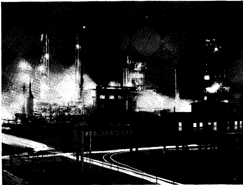
The Taching Chemical Fertilizer Plant at night.

R ECOVERING swiftly from last year's strong earthquake, the Luchiato colliery under the Kailian Coal Mine produced 7,831 tons of coal on December 18, 1976, reaching the pre-quake daily average level of last July. All coal was dressed and shipped to the