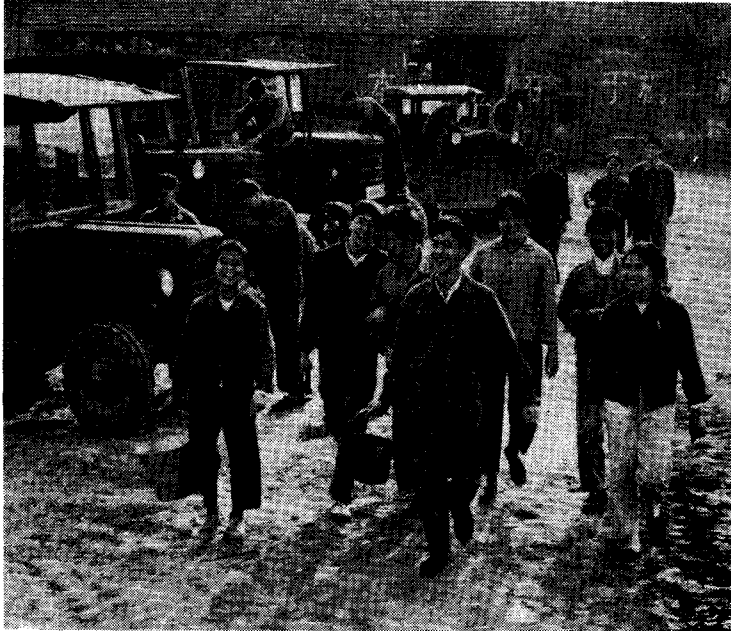
Young tractor drivers in Nanhhsien County, Hunan Province.

people. Advancing in the face of the evil wind fanned up by the "gang of four" and sweeping away its interference, the cadres and masses in the rural areas have pushed forward the learn-from-Tachai movement in the midst of acute class struggle.