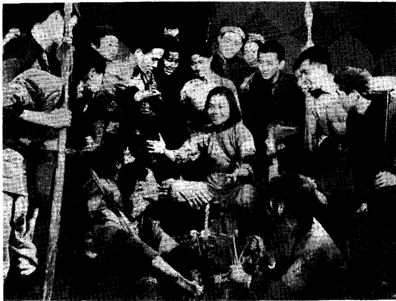
A scene from Red Guards of Hunghu Lake .

Premier Chou, Chu Teh, Yeh Chien-ying and other comrades of the Party Central Committee saw and lauded this drama, but Chiang Ching kept it off the stage for many years on the preposterous charge that its portrayal of the heroic men and women who had battled and triumphed over hardship and deprivation only showed "a swarm of beggars hopping about the stage."