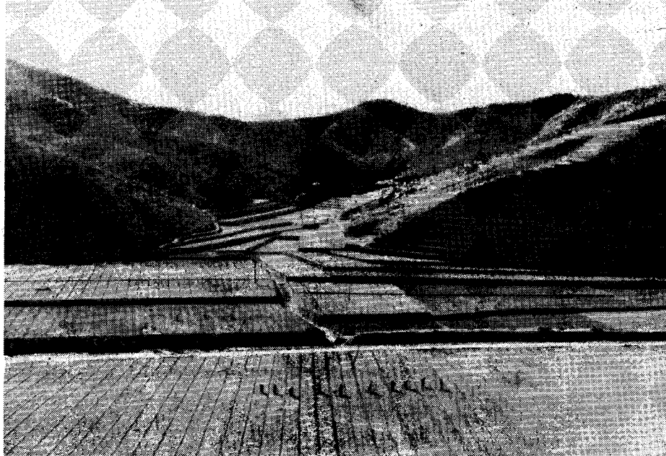
Tachai-type fields in Yentai Prefecture, Shantung Province.

for example, were set up in all the people's communes in Hunan Province and over 96 per cent of their production brigades, and their proceeds accounted for 25 per cent of the communes' total income (referring to the total income of the communes themselves and their production brigades and teams as well). In the past two years, there was a huge increase in funds and materials for buying and making farm machinery, building water conservancy projects and aiding poor brigades.