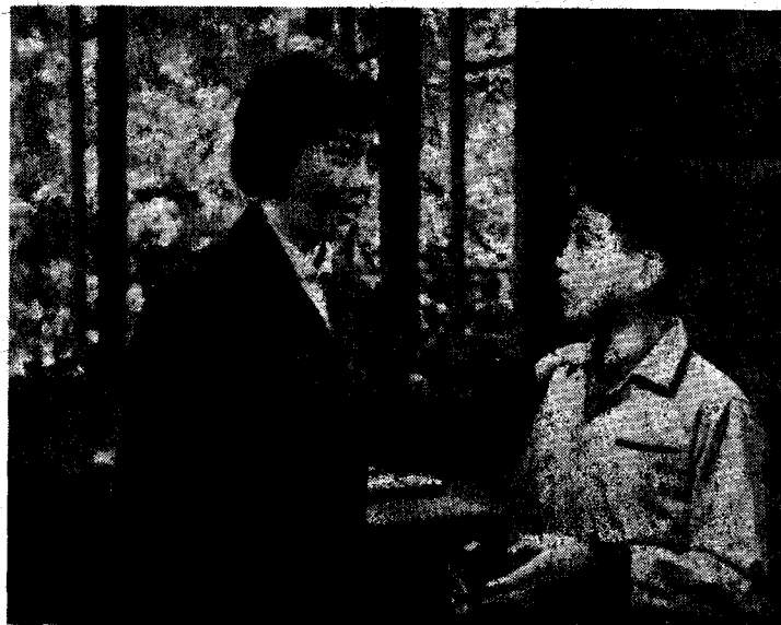
Teacher and pupil in Song of a Gardener .

Many outstanding pre-Cultural Revolution works long banished from stage and screen by the "gang of four" are now again on the repertoire. One of them is The East Is Red , a colour film of the song and dance pageant of the same name which was made under the personal care and concern of Chairman Mao. The Chairman had issued important directives concerning the work after seeing it, and on October 16, 1964