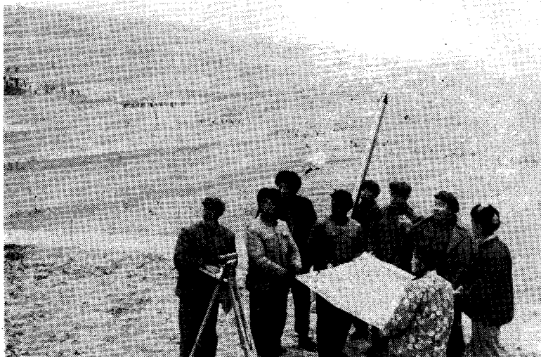
Leading members of the Party committee of Tungwei County and commune and brigade cadres mapping out a plan for farmland capital construction.

Comrade Hua Kuo-feng pointed out in his 1975 report that it is necessary "to guide the cadres' and masses' socialist enthusiasm engendered in the course of vigorously criticizing capitalism on to the great drive to develop socialist agriculture." In the 1975-76 winter-spring period, the various localities brought about an upsurge in farmland capital construction involving building water conservancy projects, terracing hillsides, improving the soil and other basic measures for expanding the cultivated area and increasing per-hectare yields. During slack farming seasons, some 60 or 70 per cent of the labour force in the rural areas were allocated to this work. Many counties and communes had their own full-time capital construction contingents. Statistics for 18 provinces, municipalities and autonomous regions show that these and other full-time contingents were manned by 17 million people. A number of large projects were jointly undertaken by several brigades, communes or counties under the unified leadership of the local Party committees