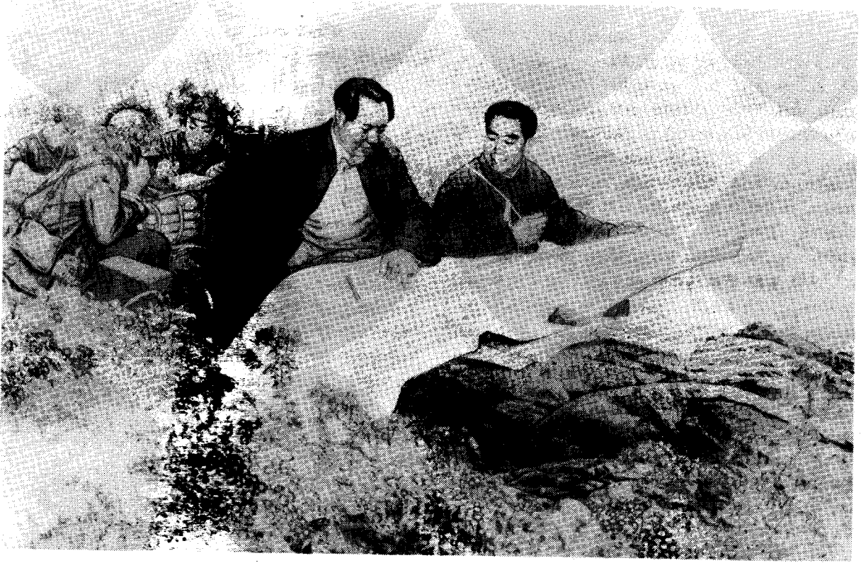
Working for the Interests of the People.