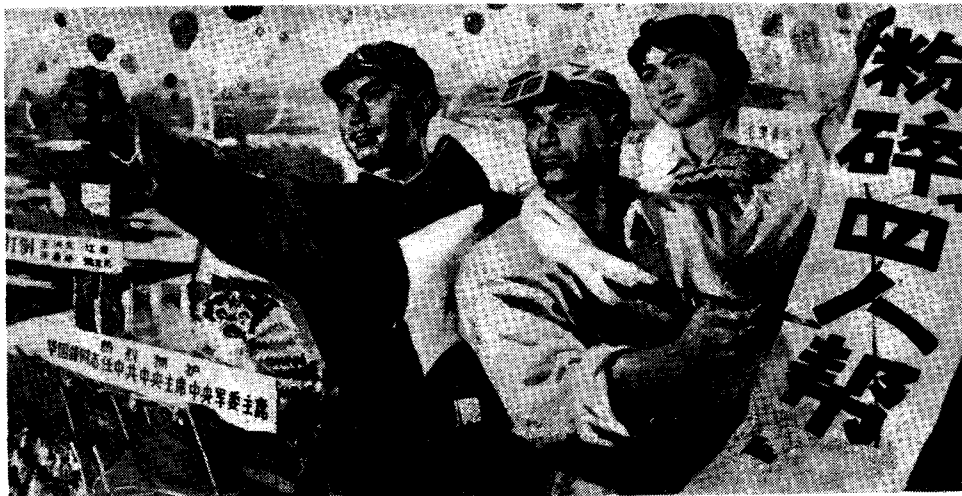
Denouncing the "Gang of Four." (A poster)

had followed Chairman Mao in the revolutionary wars and faithfully carried out Chairman Mao's revolutionary line.