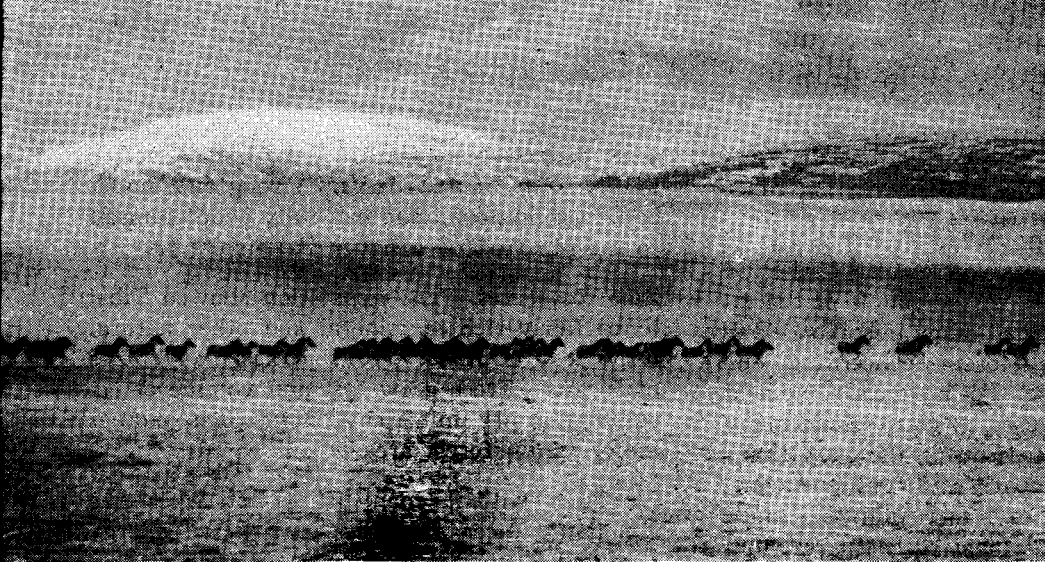
Wild donkeys in northern Tibet.

shown that the thickness of the earth's crust in this area is only about 48 kilometres while the crust in the vicinity of Lhasa where the mountains are not so high, is 70 kilometres thick.