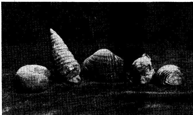
Mesozoic era fossils some 100 to 200 million years old.

Research work carried out by Chinese scientists of alpine physiology (studies on the human body's ability to acclimatize on high mountains and effects on the human body of physical labour at high altitude) established that although human activities are greatly affected on the Chinghai-Tibet Plateau averaging over