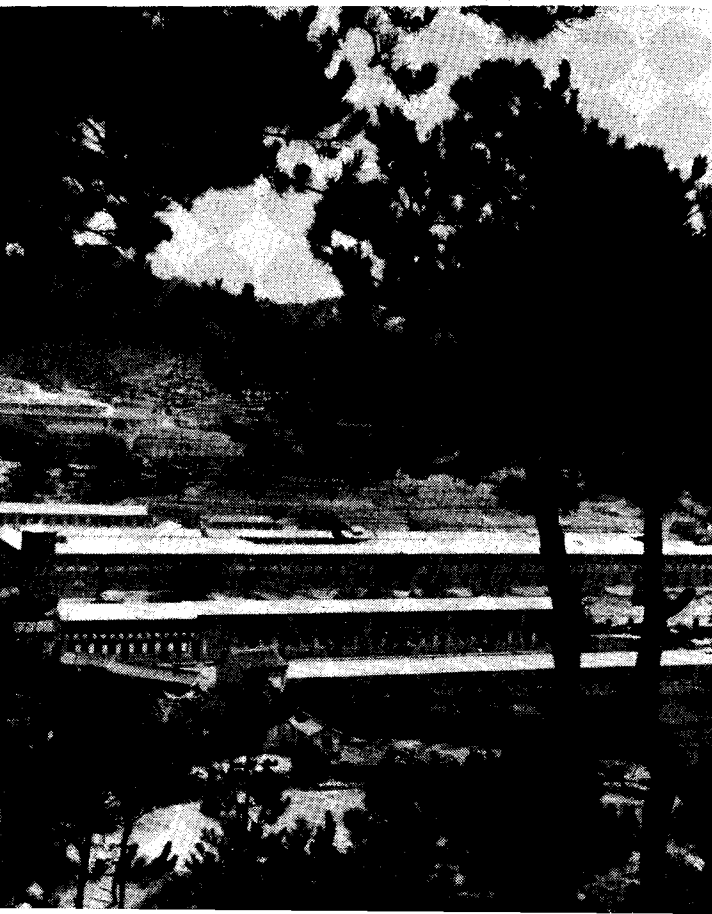
Newly built houses in the Paiyangyu Production Brigade of Hsiyang County, China's first Tachai-type county.

taking steady steps, moving first from mutual-aid teams which contain rudiments of socialism to semi-socialist and later to fully socialist co-operatives.*" ( Two Talks on Mutual Aid and Co-operation in Agriculture. ) It was because of this that the co-operative transformation of agriculture was realized in a relatively short period of time and output increased year after year. Shansi Province accomplished in the main the socialist transformation of agriculture in spring 1956. That year, grain output in the province hit an all-time high.