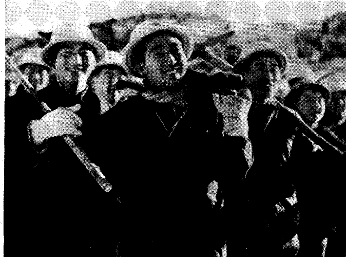
Large-scale farmland capital construction is being undertaken in Hsiyang County. Photo shows a specialized team on their way to work.

On the other hand, with the growth of the productive forces, it is necessary to make timely changes in those aspects of the relations of production that do not correspond to the development of the productive forces. We must pay attention to improving and adjusting the relations among people in the course of production, and adhere to the principle of "from each according to his ability, to each according to his work" and implement the Party's economic policies in the rural areas so as to put those things to rights which were turned upside down by the "gang of four." As regards the system of ownership, if we take the situation in most parts of China into consideration, the present