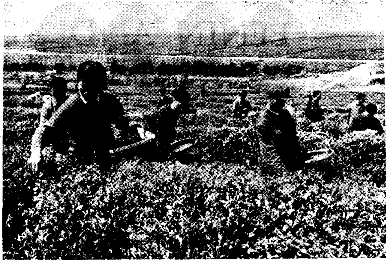
Picking spring tea.

Meat bones recovered from restaurants and residents are