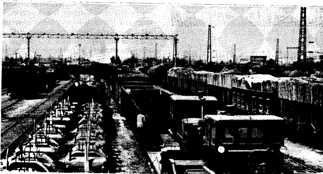
Freight trains at a station in Szechuan Province.

The movement to expose and criticize the gang has fired the masses with great enthusiasm for socialism and they are determined to race against time and make up for the losses caused by the gang. Meanwhile some basic questions of right and wrong are being gradually clarified so that Chairman Mao's line in running enterprises can be implemented again. Also, many enterprises have strengthened and improved their leading bodies through consolidation during the movement. While grasping revolution and promoting production, responsible members are leading the workers, engineers, technicians and managerial personnel in boosting production. Chaos has given way to order and the situation on the entire industrial front is getting better and better. The Party Central Committee recently promulgated the Draft Decision Concerning Some Problems in Speeding Up the Development of Industry which is now being carried out throughout the nation on a trial basis. (See "The Week" in this issue.)