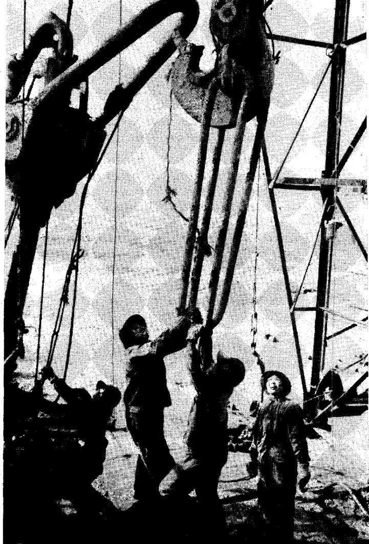
Women drillers at Shengli Oilfield.

Some major issues of right and wrong which were confused by the gang have also been gradually clarified. One example of this is the question of how to properly assess the situation in industry, communications and transport before the start of the Cultural Revolution. To usurp Party and state power, the gang went out of its way to whip up a campaign to suspect and negate everything, and to paint a dark picture everywhere of the work done in the 17 years between the founding of the People's