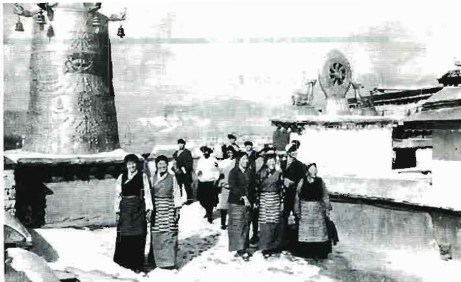
Jokhan Monastery in Lhasa reopened.

Nevertheless, the situation is complicated in real life. Some people are accustomed to such practices as worshipping their ancestors, believing in the existence of a soul, spirits and ghosts. So long as their activities do not affect the political and productive activities of the