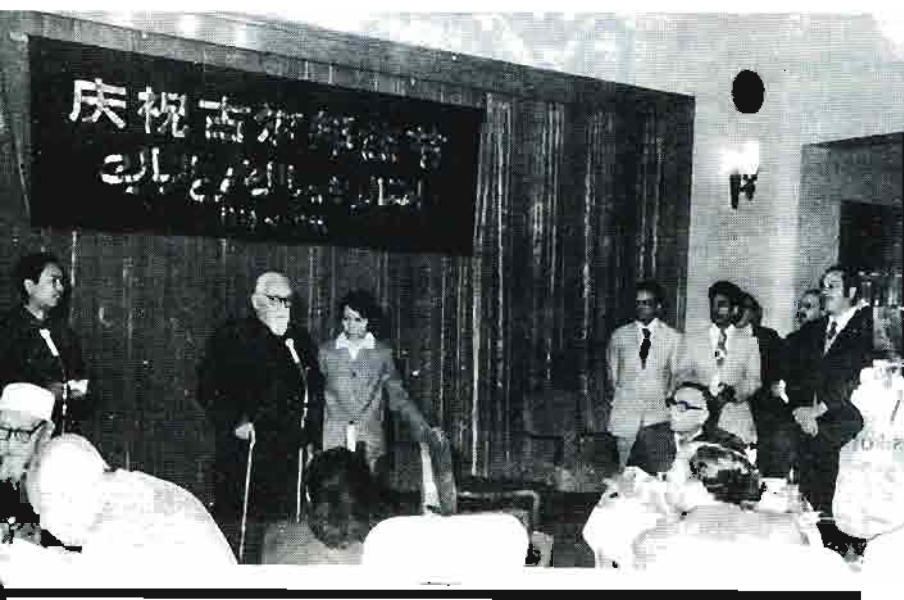
Burban Shahidi, Chairman of the China Islamic Association, speaking at a Corban festival reception.

However, religious freedom was practically non-existent when Lin Biao and the gang of four held sway. In order to restore the Party's religious policy, Article 147 of the Criminal Law, which was promulgated last