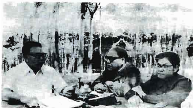
Pol Pot (left), Ieng Sary (middle) and Mrs. Ieng Thirith in the jungles of western Kampuchea.

Ten Caribbean countries condemned the rebellion and pledged support for Cato's government. A government spokesman of Grenada, a neighbouring country to the south of St. Vincent and Grenadines, denied any involvement of his country in the rebellion.