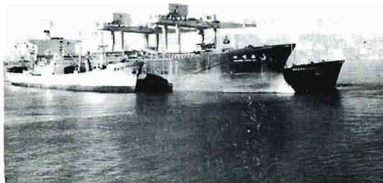
China's first 100,000-ton offshore platform for handling cargo.

In order to keep pace with expanding foreign trade, eight major automatic loading and unloading projects as well as some pontoons are being built for the harbour.