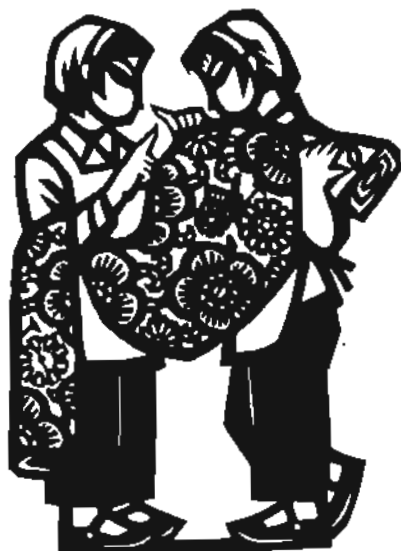
The latest pattern. Paper-cut by Zhao Yuliang

(An abridged translation of a "Renmin Ribao" article, October 20.)