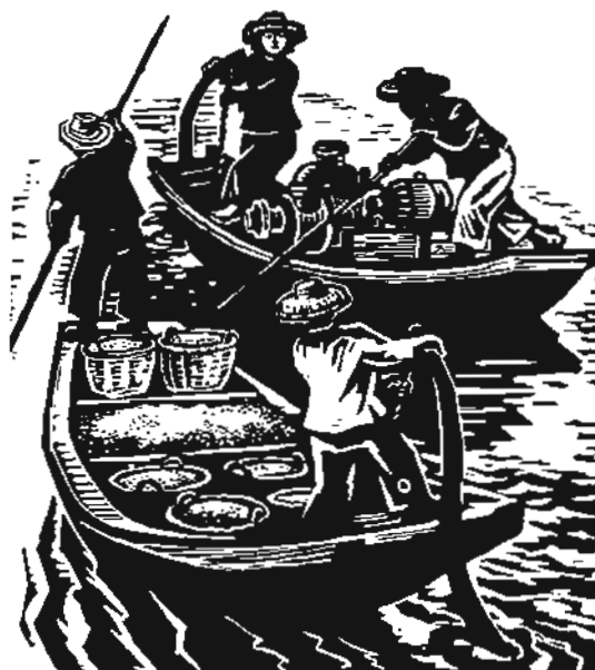
Urban-rural trade. Woodcut by Gu Yuan

In the distribution of the investment in industry itself, the proportion between light and heavy industries was 1 : 8 during the First Five-Year Plan, 1:10.8 during the Second Five-Year Plan, 1:12.8 during the three years of economic readjustment (1963-65), 1:14.1 during the Third Five-Year Plan (1966-70), 1:10.2 during the Fourth Five-Year Plan (1970-75) and 1:8.3 in the first three years of the Fifth Five-Year Plan period (1976-80). Although there has been an increase in the investment in light industry in the last three years, generally speaking, that in heavy industry has been too "heavy" and that in light industry too "light." This is quite obvious. Furthermore, in heavy industry itself, the metallurgical industry got the lion's share of investments. Between 1952 and 1978, state investment in capital construction in that branch alone was more than twice as much as that in the whole of light industry. During the early years of the founding of the People's Republic, it was quite necessary to maintain a high proportion of investment in heavy industry, the metallurgical branch in particular, considering the undeveloped state of basic industry in our country. But as the situation changed, there should have been a proper increase in the proportion of investments in agriculture and light industry and a relatively smaller proportion of investment in heavy industry. Actually