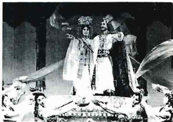
A scene from Princess Wencheng .

• Performances by the New Zealand Maori Song and Dance Group.