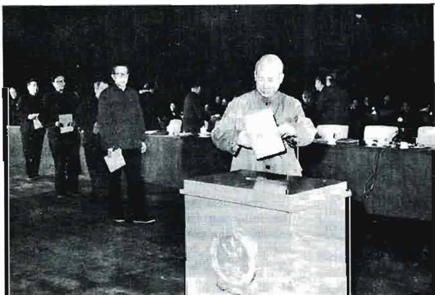
Deputies to the Beijing Municipal People's Congress electing the mayor and other municipal leaders in December.

According to the government work report made by Lin Hujia on behalf of the former municipal revolutionary committee, a group of non-Communist specialists and other people will be made directors and deputy directors of departments and bureaus under the municipal government. It is anticipated that non-Communists will also join governments of districts and counties under the Beijing municipality. "Non-Communists will be guaranteed the same powers as Communists holding the same posts," Lin Hujia stressed.