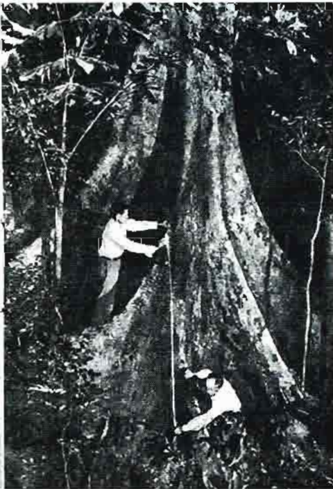
Measuring a banyan tree in a protected area of Dinghu Mountain.

This discovery has sparked interest in diamond prospecting in the area.