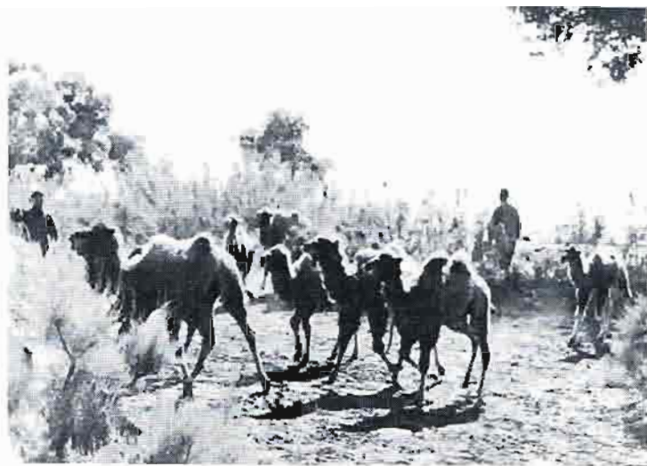
Herding young camels in Inner Mongolia.

A camel, in general, has a life span of 30 years. Last year the Inner Mongolian Autonomous Region, the main breeding base of double-hump camels in China, raised 380,000 camels, accounting for more than half the total in China.