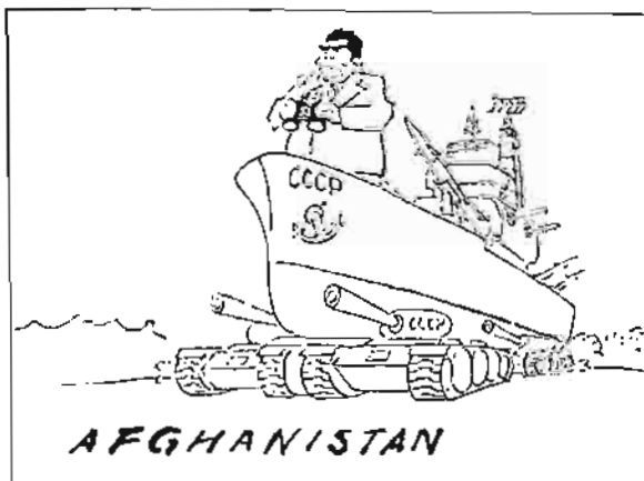
Afghanistan — overland to warm waters. Cartoon by Wei Qimei.

The people of Afghanistan are dauntless. They had three times humbled imperialist Britain between 1838 and 1919. Today, Soviet social-imperialism is running up against the same heroic resistance of the Afghan people to alien aggression.