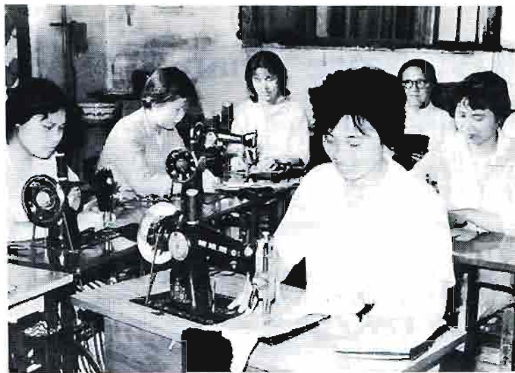
A neighbourhood sewing shop in Wuxi, Jiangsu Province.

The unbalanced development between various economic sectors, particularly between agriculture and industry, was another major factor. Light industry, commerce, catering and service trades in cities could not develop as they should. Though the urban population increased sharply in