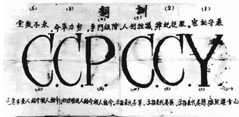
The text of oath taken by new members of the Communist Party and Communist Youth League.

This precious document is a testimony to the building up of the Party in the revolutionary base areas. Though similar oaths have been found, none are from such an early period. Also this oath is particularly valuable as it was used both for admitting new Party and League members.