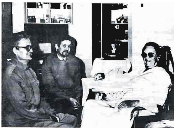
President Tito with his sons on January 23.

Central Committee, the presidential office, and TANJUG, the Yugoslav news agency, and every Yugoslav newspaper office. Far more than expressions of the people's deep love for their President, they were a spontaneous "public opinion poll," which reflected the people's firm will and resolve to safeguard their independence, freedom and democracy and to build socialism in accordance with their own conditions.