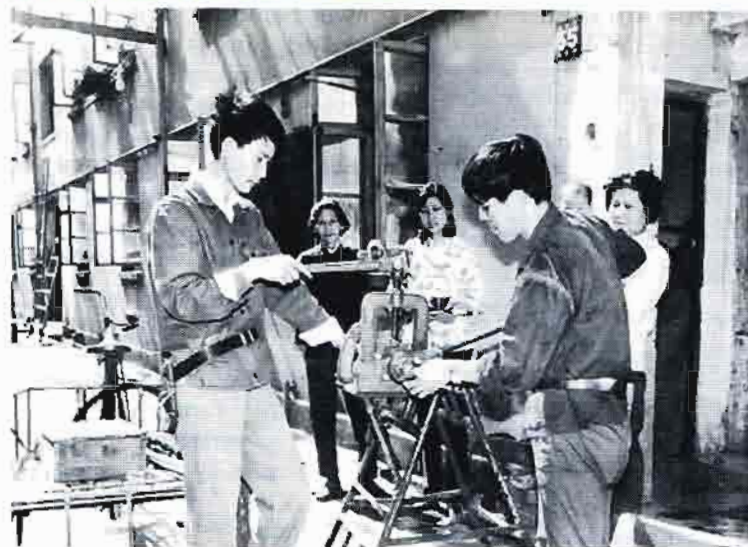
Young workers of a Shanghai service centre repairing local residents' water meters.

enterprises had no choice of personnel and could not get all those who were qualified and willing to work there, neither could job-seeking youths choose the jobs or the units they liked. We are changing this system of recruitment. Now those waiting for work can voluntarily apply for jobs and the enterprises or departments concerned can choose the best qualified first through examinations. Both sides have a choice, thereby helping to eliminate the above-mentioned shortcomings