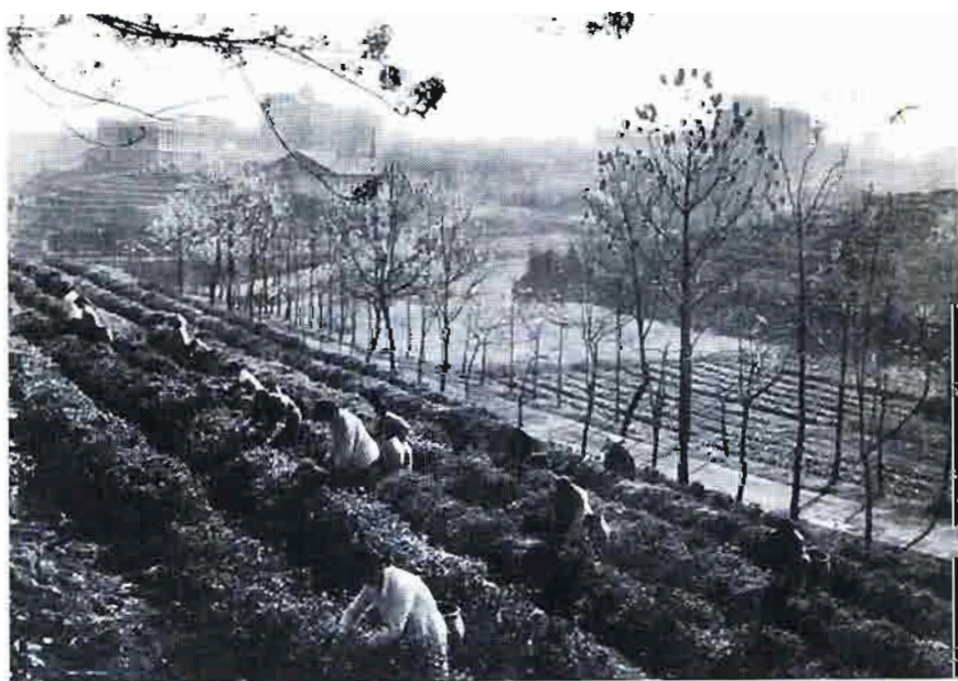
Tea cultivation on Hongqi Comprehensive Farm.

During this period, the farm was investing funds and manure each year, but obtaining no return. To offset their losses, they set up some piggeries, vegetable gardens, a tea processing plant, a mill for making vermicelli, a starch factory, an ore plant and an electrical machinery factory. Income rapidly increased with the gross output value of industry and agriculture amounting to 4.7 million yuan (540,000 yuan for agriculture) in 1978 and 6 million yuan in 1979.