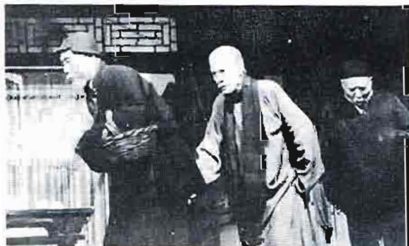
The last scene from "Teahouse" when the three old friends throw a mock funeral, denouncing their fate.

The Beijing People's Art Theatre, one of the major companies in China, has staged more than 100 plays by Chinese and foreign playwrights since it was established in 1952. It also has presented seven of Lao She's plays. Some of the