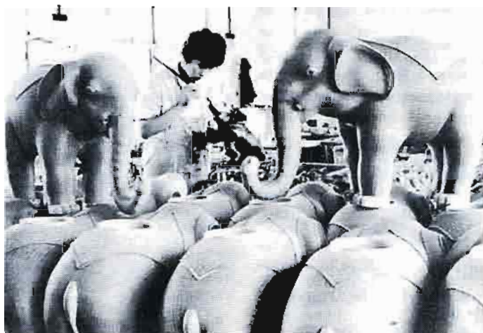
One of 16 bamboo-weaving arcraft shops in Shengxian County, Zhejiang Province. Their products sell readily at home and abroad.

A: There has been a major reform in our system for recruiting workers. In the past, workers were assigned to enterprises by state labour departments under a unified plan. The