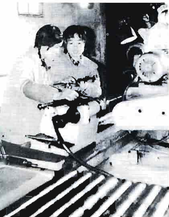
A farm machinery repair shop of the Liuzhuang Production Brigade.

prises were successively set up. These include a flour mill, a food-processing factory and a restaurant, a paper mill using wheat straw and maize stalks as raw materials, a livestock farm raising mostly cows and pigs, a milk powder factory, a machinery workshop geared to promoting agricultural mechanization and producing parts for the large urban industries, a woodworking shop, a brick kiln, a teamsters' group, a repair, maintenance and building team, an orchard and vegetable gardens. All these play a role in building up the local economy and serving the needs of the people in their daily life in the countryside. Since 1975 all these enterprises have undergone relatively substantial developments. This is the road to prosperity and it offers tremendous scope for the young people to bring their abilities into full play.