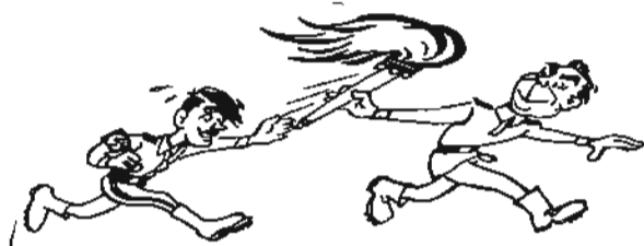
Cartoon by Zi Ji

As everyone knows, friendship and peace are the main content of the Olympic spirit. The rules of the Olympic movement were drawn up according to this spirit and they have won worldwide recognition. When the Soviet Union made its bid to sponsor the forthcoming Summer Olympics, it publicly promised to uphold the Olympic spirit and abide by the Olympic rules. In 1976 Brezhnev sent a message to the International Olympic Committee and the participants of the Montreal Games vowing that the Soviet Union "supports and will continue to support" the modern Olympic movement. The Soviet