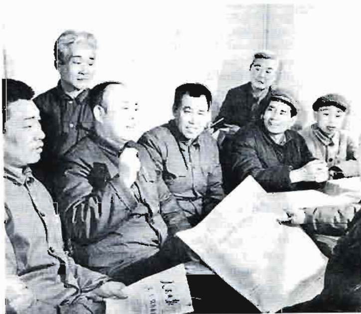
Party committee members of the Beijing No. 2 Rolling Mill studying the Guiding Principles.

But owing to victory in the revolutionary struggle and the Party's position as the ruling political party in the whole country, some comrades became conceited and complacent. Owing to imperfections in the democratic centralism of the Party and state, and owing to the influence of feudal and bourgeois ideas, unhealthy tendencies, such as isolation from reality and the masses, subjectivism, bureaucratism, arbitrariness and privilege seeking somewhat developed within the Party. At the same time, because of the shortcomings and mistakes in guiding inner-Party struggle, normal inner-Party political life was impaired to a certain extent. During the Cultural Revolution in particular, Lin Biao and the gang of four, out of their needs in usurping Party and state leadership, took advantage of serious