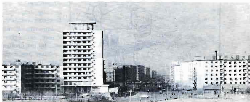
New housing in Shenyang, Liaoning Province.

Factories making prefabricated parts and concrete structures are being built in Beijing, Shenyang and Wuban. By 1982, these factories will provide prefabricated parts for houses with a total floor space of 3 million square metres.