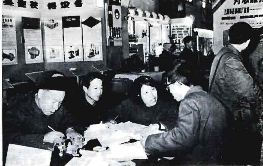
At the exhibition fair of the Shanghai, General Machinery Company.

two years sewing machines increased by 145,000, which exceeded the total increase in the previous eight years.