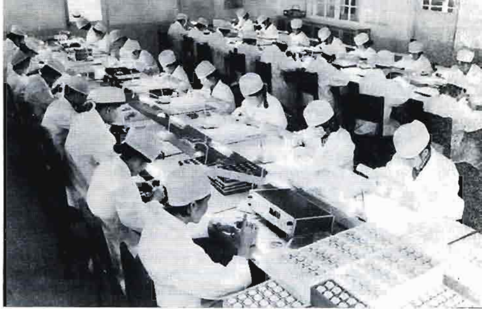
Workers of the Shanghai Watch Factory assembling third-generation quartz watches.

According to a recent decision of the central authorities, as from this year the "Jiangsu ex-