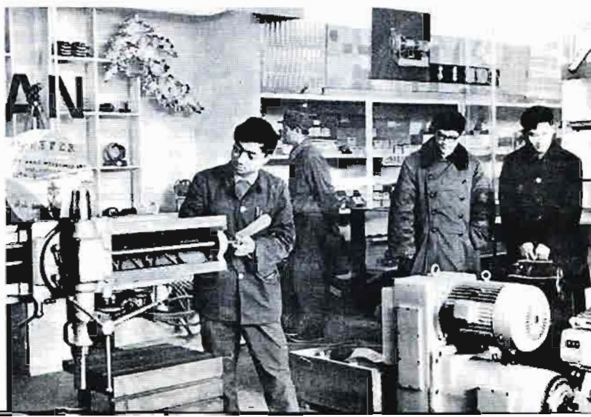
A corner of the showroom of the Sichuan Capital Goods Company.

In the light of this situation, selectively