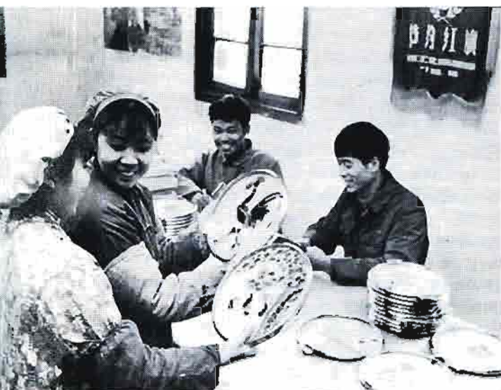
Small wares and notions made out of leftover materials by the Shanghai Stainless Steel Utensils Factory

In foreign trade, the old practice according to which the producer has no direct contact