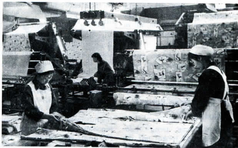
To meet the needs of the people, the Beijing Printing and Dyeing Mill has increased its production of cloth with new designs for decorative purposes.

In 1980, the state granted a loan of 2,000 million yuan for the light, textile and electronic industries while the local authorities appropriated a sizable amount of funds for the light