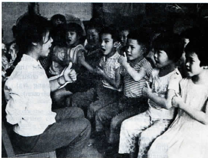
Sign language training for pre-school children.

Endemic goiter and cretinism, caused by iodine deficiency due to particular geographical conditions are two main factors giving rise to deafness. In northern China there are about 160 million people exposed to the menace of goiter. Cretinism occurred in places with a high incidence of goiter. Now that the state has founded specialized agencies to carry out preventive work and treatment, enormous quantities of iodine salt, iodized edible oil and potassium iodine have been supplied to the iodine-deficient areas, with the result that the number of patients has gone down considerably. Taibai County, in Shaanxi Province, northwest China, has made outstanding achievements in this respect. Today no children under 15 suffer from cretinism and now there are also no cases of blindness due to this disease.