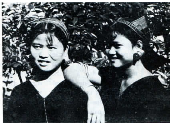
Women of the Va nationality.

Pictures on display show the colourful tattooing of men of the Va nationality, the needled designs on the faces of the Dulong women and other minority adornments such as head hoops, giant earrings, bracelets and necklaces. Many of these items have never been seen before by residents of Beijing.