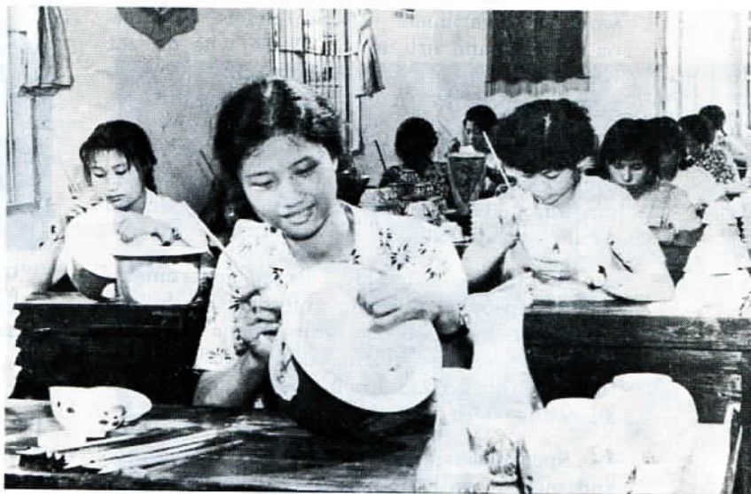
Deaf women workers in a social welfare factory in Jingdezhen, Jiangxi Province, painting floral designs on porcelain vessels.

In Chongqing, southwest China, the Hongyan factory manufacturing switches is one which in recent years has produced an annual output value equivalent to about two million U.S. dollars and a yearly profit exceeding a hundred thousand dollars. The money is used to build houses for these handicapped workers and staff members, finance nurseries, set up