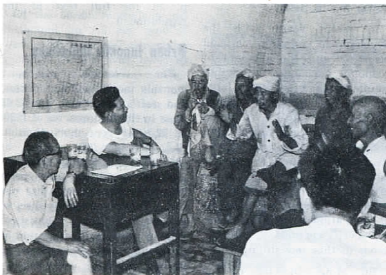
Cadres talking with peasants who assisted in the war to liberate northern Shaanxi Province in 1948.