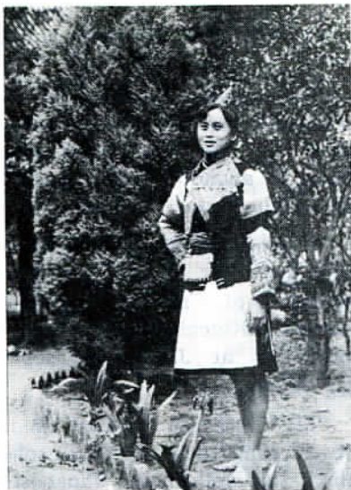
A Yi woman wearing a cockscomb hat.

Sponsored by the Yunnan Museum, the exhibition displays hundreds of pictures and samples of shoes, dresses, earrings, necklaces, daggers and belts of various unique styles. It is intended to explain the history, daily life, culture and customs of the minority people, and to help enhance mutual understanding and