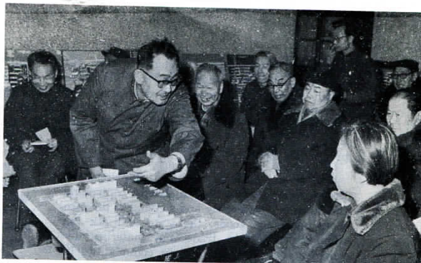
The model of the Tayuan residential quarter designed by the architectural department of Beijing's Qinghua University.

The target for steel production this year, originally set at 35 million tons, is being lowered to 33 million tons, thus allowing the fuel,