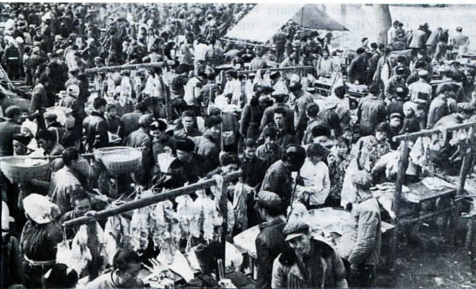
A village fair in Guizhou Province's Guiding County.

State revenues for 1981 were originally targeted at 107,400 million yuan (not including foreign loans). They were readjusted to 97,600 million yuan because of the readjusted cut in the output of oil and coal, the decrease of income of industrial enterprises, and the decrease of revenue from industrial and commercial taxes, plus the increase in the foreign trade