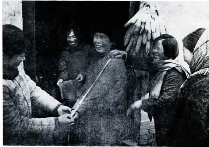
Peasant women making clothes for their mother-in-law.

Article 22 Grandparents or maternal grandparents who have the capacity to bear the relevant costs have the duty to rear their grandchildren or maternal grandchildren who are