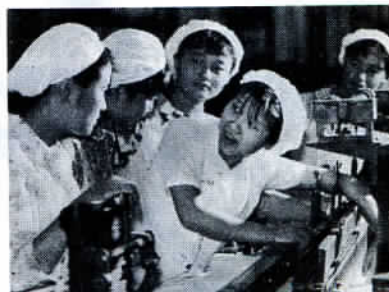
Shanghai textile workers exchanging experience.

There is at present a "freeze" in the relations between the two countries. An article explains the reason why (p. 10).