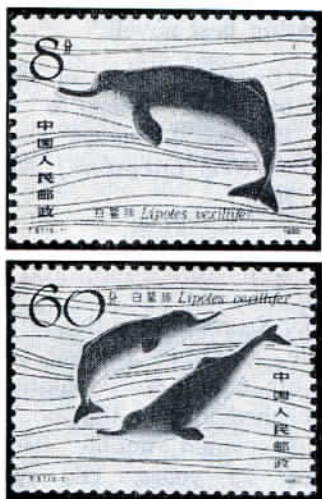
A set of stamps picturing dolphins.

A young Chinese river dolphin ( Lipotes vexillifer ) captured by fishermen of Hunan Province on the Changjiang (Yangtze) River 14 months ago (see issue No. 12, 1980) has successfully adapted itself to life in captivity. In fact, the precious mammal has gained almost 23 kilogrammes in weight during this period, and its feeders have recently put it on a special diet because they are afraid it may be getting too fat.