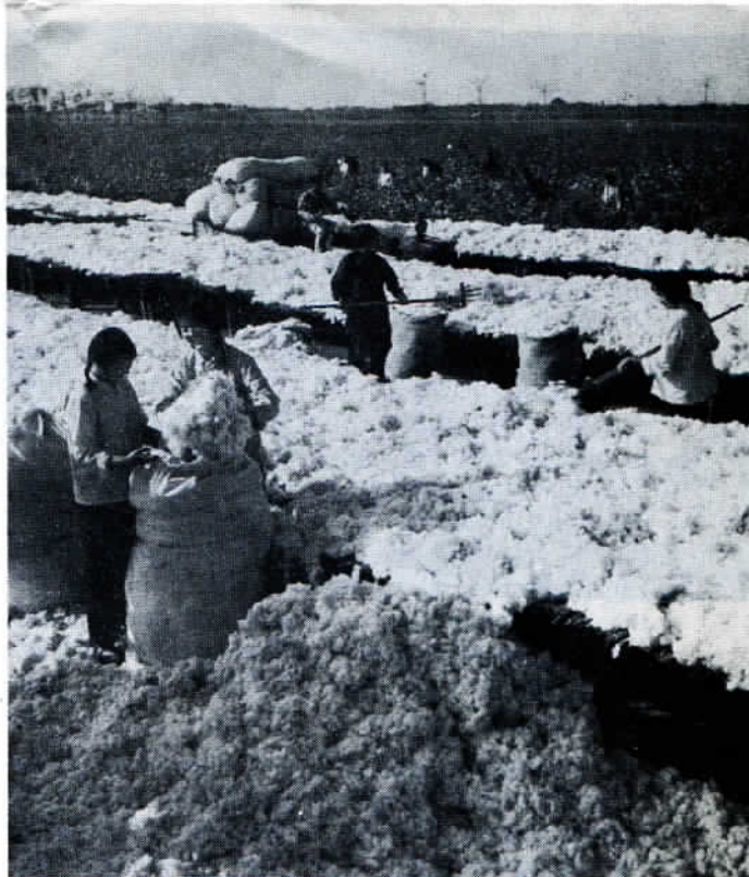
Good cotton harvest in Fugou County, Henan Province.

In such an excellent situation, why do we say that there are still potential dangers and it is necessary to carry out further readjustment? Because the fulfilment of the 1980 national economic plan has revealed several problems