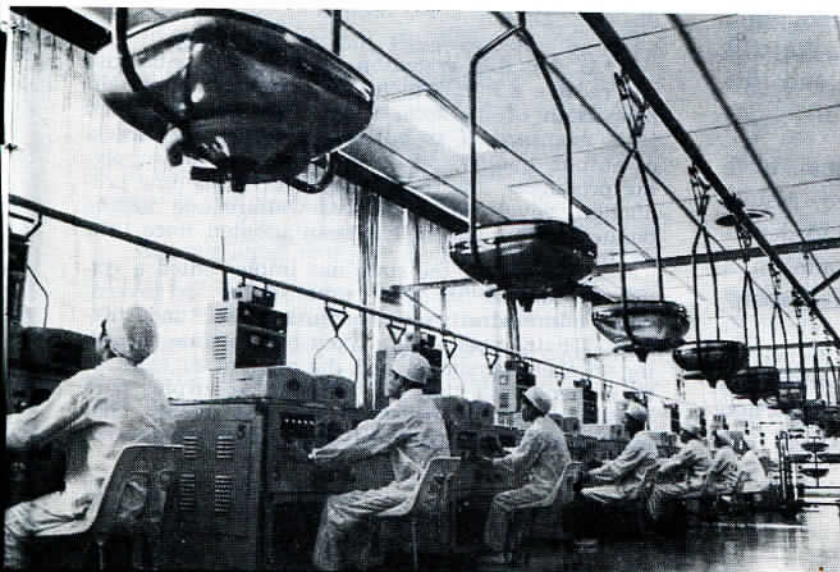
A new production line in Shanghai for producing large-screen picture tubes.

Mainly Relying on Our Own Efforts but Not Closing the Country to the World. In a populous, large country like ours, modern construction must mainly rely on our own efforts; that is, mainly rely on our own industrial foundation, on our technical strength and domestic market. This basic principle is inalterable. But this does not mean we will close our country to international exchanges. It is also our inalterable principle to develop economic and technical co-operation and exchanges with foreign countries on the basis of the principle of equality and mutual benefit. During the period of economic readjustment, we will adequately reduce the scale of importing equipment and will correspondingly rearrange certain joint projects with other countries. But this is not a signal of a change of policy. With the progress of our economic readjustment and the development of our national economy, the scope of our economic co-operation and technical exchanges with foreign countries will become increasingly larger.