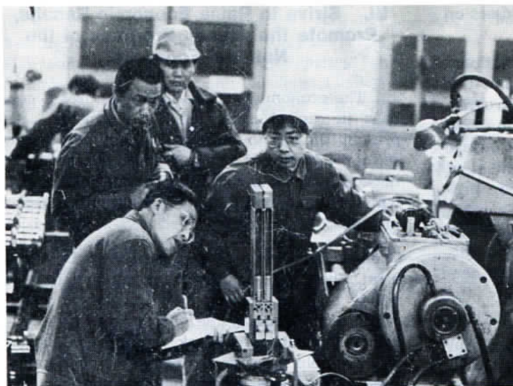
Performing a quality test at the Beijing General Internal-Combustion Engine Plant.

The country's poor economic returns in production, construction and circulation, and the irrational structure of the national economy cannot be separated from the drawbacks of our current economic setup. It is impossible for us to fundamentally improve management and raise the results of economic activities if this setup is not reformed.