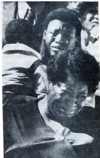
Grief-stricken relatives of a murdered black child in Atlanta.

The recent growth of racism, crime and reaction in the United States points to deeplying social causes. It is significant that most members of the criminal KKK are under 30 years old. And despite the no-