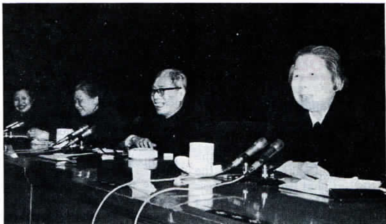
Deng Yingchao (first from right), Honorary President of the All-China Women's Federation, giving a speech at the meeting marking International Working Women's Day.

He asked the federation to do the following: