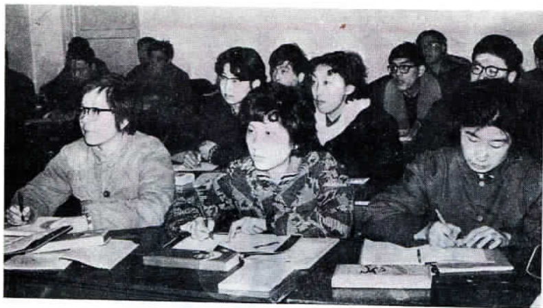
Mathematics students at the Beijing spare-time college.