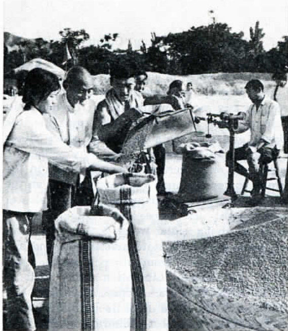
A Shanxi Province's commune implementing the principle of distribution according to work.

1973 to 1977 output for the county dropped each year. Yet the county padded its figures and reported that its output went up by 24 per cent during that period. Worse, no one was allowed to tell the truth, nor so much as even to question it, unless he wanted to be accused of "denigrating the national model" and to suffer all the political consequences that went with that charge.