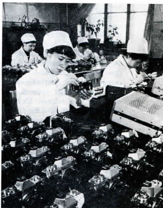
"Peacock" cameras produced by a factory in Harbin in northeast China's Heilongjiang Province.

Light and textile industries have developed in the current economic readjustment. Their output value in 1980 rose by 17.4 per cent over that of 1979. Though this speed of development was much faster than heavy industry, whose output