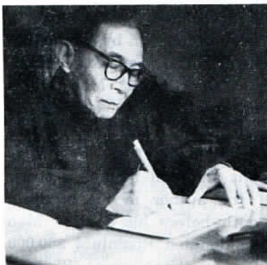
Mao Dun writing his memoirs in November 1980.

After the failure of the revolution of 1925-27, he wrote Disillusion , Vacillation and Pursuit , using for the first time the pen name of Mao Dun. These depicted the attitude of petty-bourgeois intellectuals in the great revolutionary storms. They also reflected the author's pessimism about the prospects for revolu-