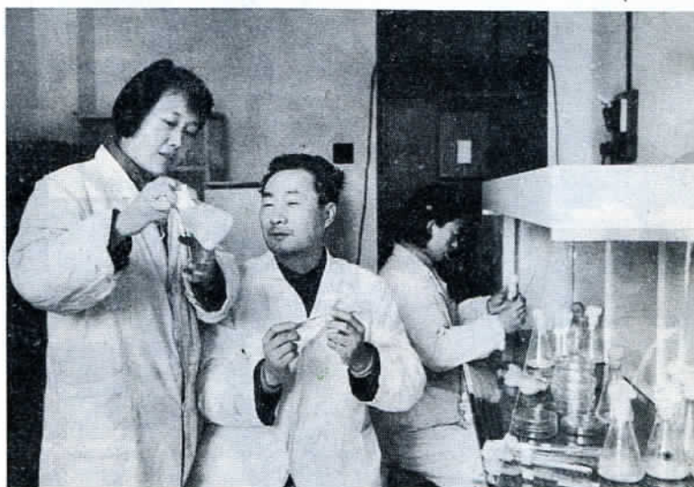
The Shanghai Pesticide Research Institute has succeeded in producing an effective antibiotic for the prevention of rice stalk diseases.

From the mid-1950s to the mid-1960s, a huge scientific and technological force had been organized in China to carry out researches on the most advanced branches of science and technology. In a comparatively short period of time, China succeeded in producing atomic and hydrogen bombs, in launching man-made earth satellites and in making a total synthesis of crystalline bovine insulin. The development of