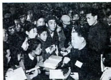
Enthusiastic readers surrounding Mao Dun (Shen Yanbing) at a Beijing book fair in 1957.

A pro-Pretoria policy is sure to alienate the United States from black Africa and the rest of the third world (p. 13).