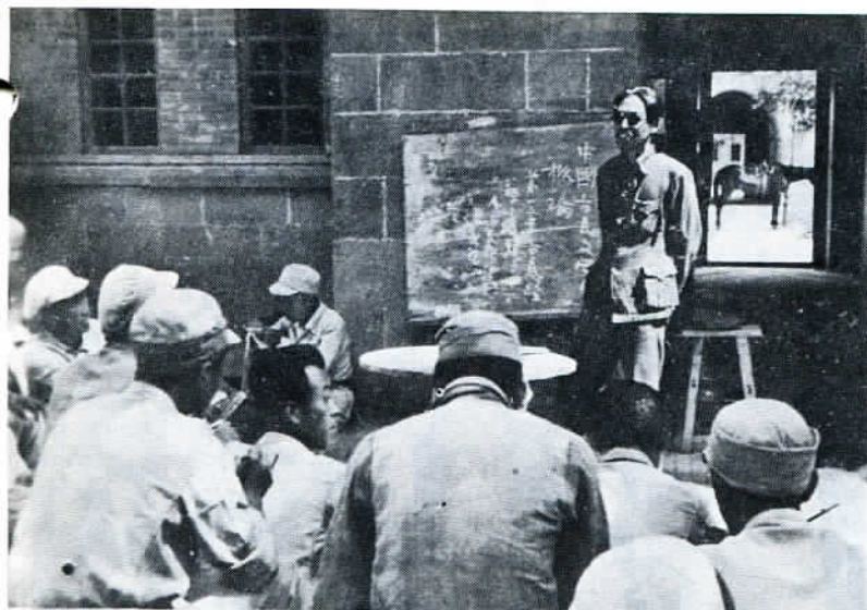
Mao Dun lecturing at the Lu Xun Academy of Arts in Yanan (1940).

When he was critically ill, he wrote once again on March 14 this year to the leading members of the Party Central Committee saying: "At this last moment, my heart is with you. I have sought and struggled all my life for the communist ideal. I request that, after my death, the Central Committee will strictly examine my whole life — merits and demerits — according to the standard of a Communist. It will be my greatest honour if the Party will posthumously