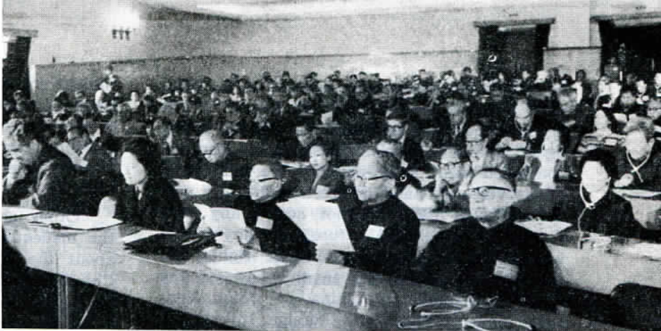
Chinese and foreign participants at the Hangzhou World Economy Symposium.

China will continue, in the present period of national economic readjustment as well as in future economic development, to pursue an open-door policy, draw upon foreign funds in a positive and prudent way, boost foreign trade, and develop economic and technical co-operation with all friendly countries.