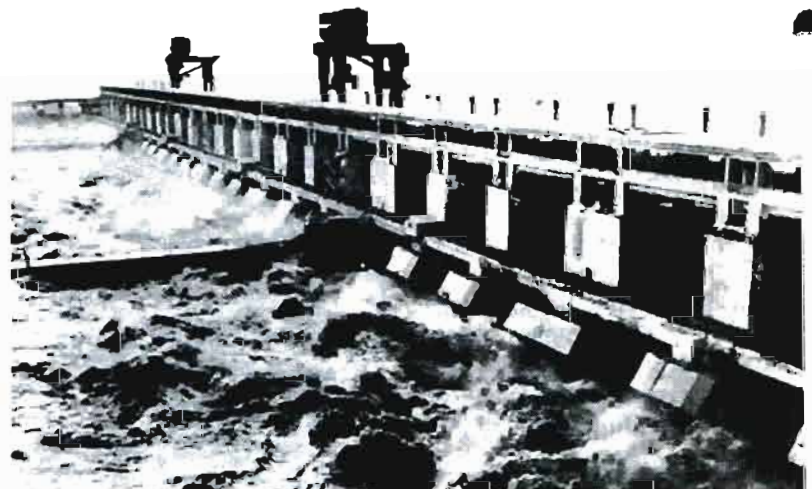
The Gezhouba dam stands rock-firm as the floodwaters rush past.

According to incomplete statistics, 753 people were killed during the flood, 558 were missing, 28,140 injured and 150,000 were rendered homeless. Crops on 660,000 hectares of farmland and 1,700 factories were submerged. Loss of property is estimated at 2,000 million yuan (about 1,136 million US dollars). But in many areas the loss was reduced