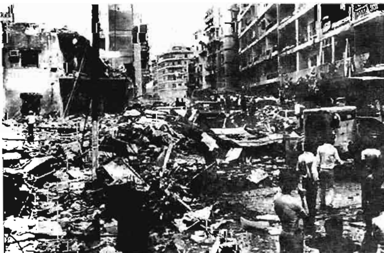
Beirut after an Israeli air raid on July 17.

Despite the announcement of a ceasefire, the situation there does not inspire optimism. Israeli military men continue to make dire threats, going so far as to hint that Israel "may be obliged to occupy Lebanon for some time." PLO Chairman Arafat has announced that the PLO will abide by the ceasefire so long as they are not attacked.