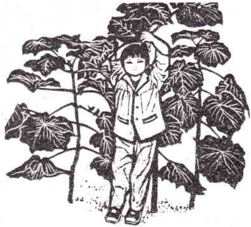
The Trees Are Taller Than I Am.