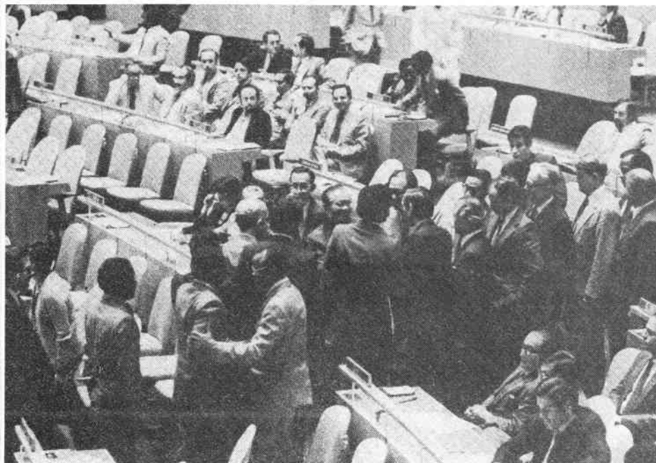
Representatives of many countries congratulating Huang Hua after his speech on disarmament at the United Nations.

Growing concern about the conventional arms race contrasts sharply with the case at the First Special UN Session on Disarmament in 1978. At the first special UN session, many countries laid emphasis on nuclear disarmament by avoiding mentioning conventional disarmament. Some of them even went so far as to assert that discussions on conventional