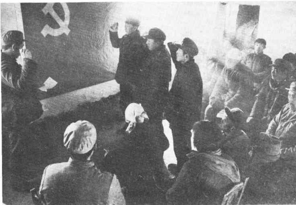
A number of peasants in Gaofang County, Shandong Province, were recently admitted into the Party.

Applicants for Party membership must go through the procedure for admission, which includes: An applicant must be recommended by two full Party members who should earnestly brief a Party branch on the applicant, and the applicant must be examined by the Party branch which