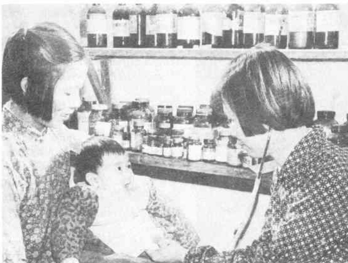
Giving a baby a medical check-up at a rural clinic in Nanhai County, Guangdong Province.

Friendly exchanges between China and Colombia have increased steadily since the establishment of diplomatic relations. In mid-June, President of the Colombian Senate Gustavo Dager Chadid paid a friendly visit to China. Premier Zhao Ziyang met with the delegation and had a cordial conversation with all the members. Prior to this, a delegation of the National People's Congress of China paid a visit to Colombia and received a warm welcome.