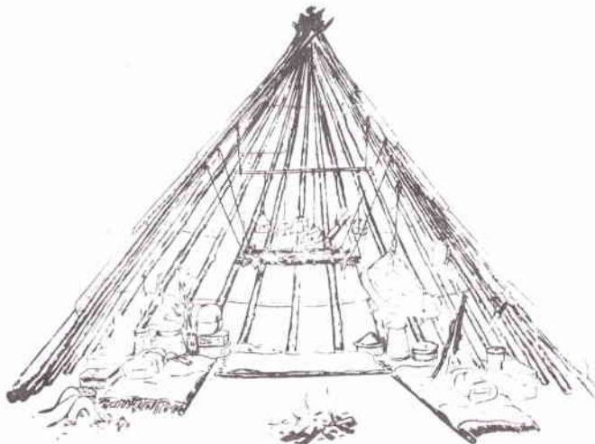
A tent of the Oroqen nationality.

Elegant costumes, jewellery, musical instruments, lacquerware and handicrafts which reveal the age-old cultures of minority nationalities are exhibited. The primitive picture on the leather face of a wooden drum