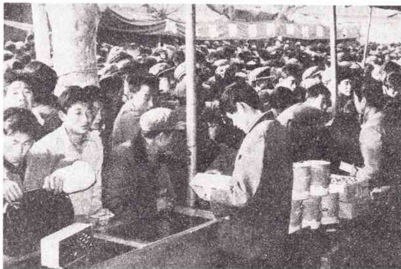
A sales exhibition of industrial goods run by the Ministry of Commerce in Fengyang County, Anhui Province.

Consumer items in heavy demand ranged from ready-made clothing and leather shoes