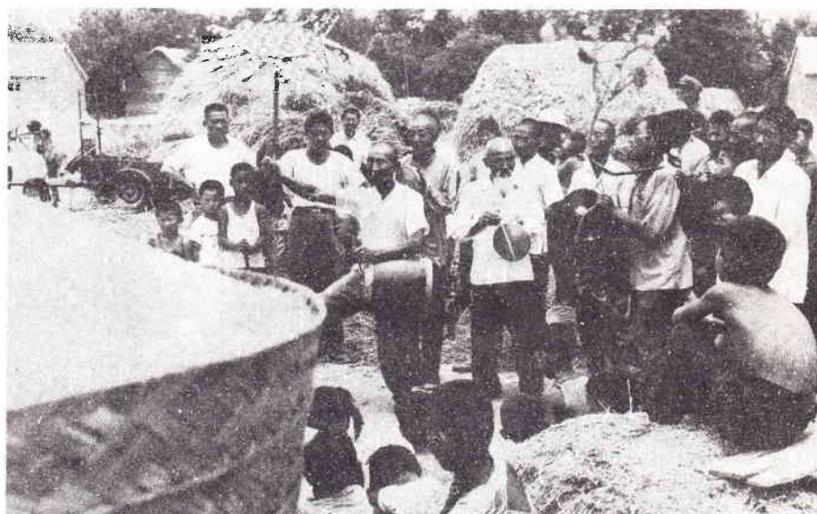
Commune members in Guzhen County, Anhui Province, beating gongs and drums in celebration of a rich summer harvest.

However, output in most northern provinces and autonomous regions dropped slightly or was close to last year's figure.