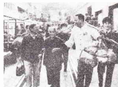
A political commissar (second from right) of the Shanghai port-administration helps carry an old woman's luggage.

A collection of eight essays by Chinese economists on major aspects of China's economic growth since liberation and the prospects in the future (p. 28).