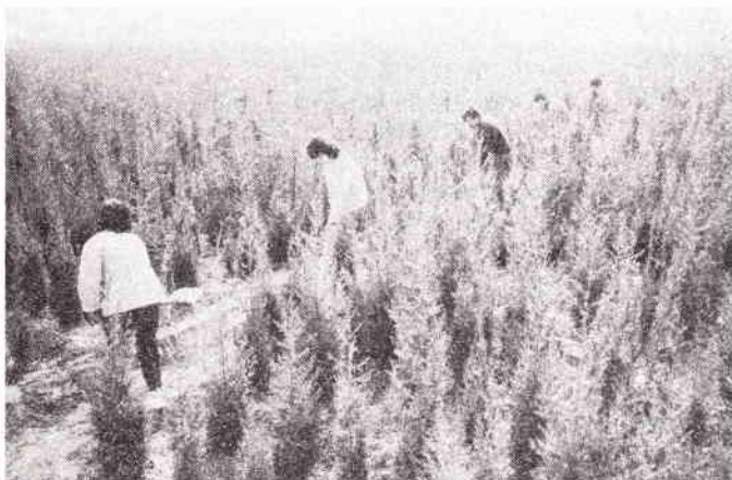
Wenquan Nursery on the Beijing outskirts will supply 1.22 million saplings to the capital this year, a nearly four-fold increase over last year.