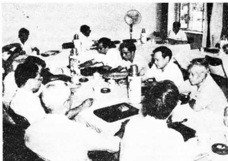
Deputies from Guangdong Province hold a group discussion.

The current excellent situation of stability and unity in our country is the result of the highly developed democracy under the leadership of the Chinese Communist Party. Political parties in capitalist countries represent only the interests of capitalists. But the Chinese Communist Party represents the interests of the workers and peasants as well as the interests of the whole nation. After the Third Plenary Session of the 11th Party Central Committee, our leaders reversed the course of events and led the country on to the orbit of healthy development. At that time, I was in Taiwan. When I heard this, I made up my mind to come