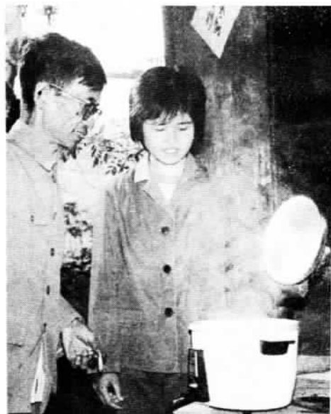
Many peasant families in Penghu, Fujian Province, now use electric cookers.

— "Zhongguo Nongmin Bao" (The Chinese Peasants Paper)