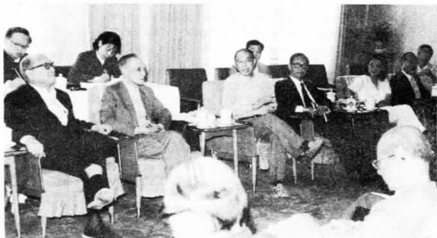
CPPCC members from Xianggang (Hongkong) and Aomen (Macao) at a group meeting.