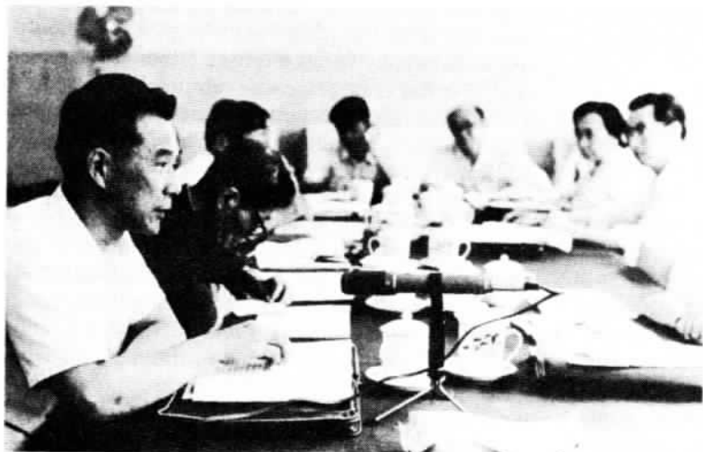
Deputies of Taiwan Province.

works should provide the people with aesthetic enjoyment and help to broaden their realm of thought and improve their morality. The 10-year "cultural revolution" polluted the spirit of the people. At that time, ignorance was regarded as an honour. Today, there is a "study fever" throughout the country and the people's level of appreciation and aesthetic judgment are rising. This calls for not only more quantity but also better quality of literary works.