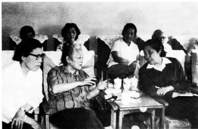
Wang Guangmei (front row, right), He Zehui (front row middle), a high-energy physicist, and others at a CPPCC group meeting.