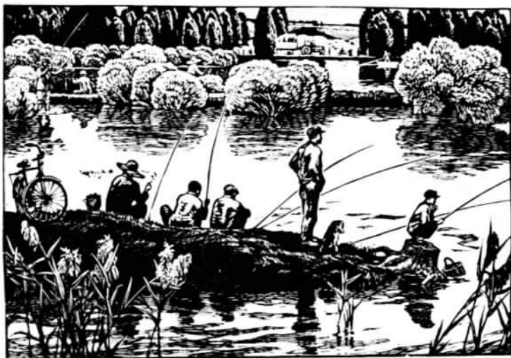
Holiday on the Farm.