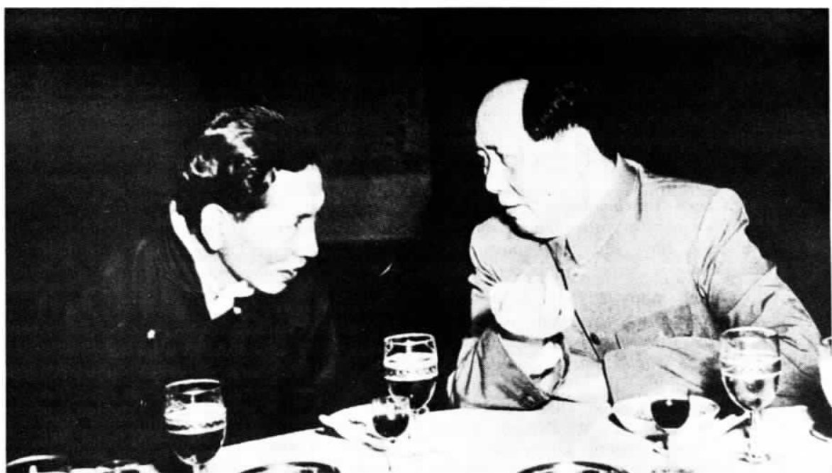
Chairman Mao Zedong gave a banquet for the local government delegation of Tibet headed by Ngapoi Ngawang Jigme in April 1951.

In 1929, the Commission for Mongolian and Tibetan Affairs of the Kuomintang government dispatched a representative to Tibet. Dalai Lama told the representative: "What I expect most of China is real unity and peace." "The British, indeed, have a mind to draw me to their side. Nevertheless, I know the importance of guarding national sovereignty." In 1930, the Tibetan local government established a representative office in Nanjing, capital of the Kuomintang government. Four years later the Kuomintang government also established a representative office in Lhasa. In 1939, the Kuomintang government sent another representative to Lhasa to officiate at the inauguration ceremony of the 14th Dalai Lama on February 22, 1940.