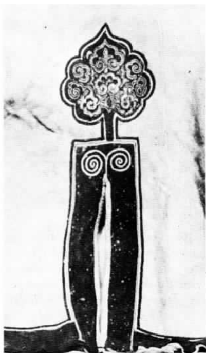
Designs at the slits of the Oroqen women's garment.

The Oroqens divide labour between the men, who are mainly hunters, and the women, who skin the animals, cook the meat and make the hides into clothing. The exhibition is a display of their artistry with garment embroidery. Those for men are embroidered mainly in black, sometimes inlaid with colour threads in bold and striking designs, combining a