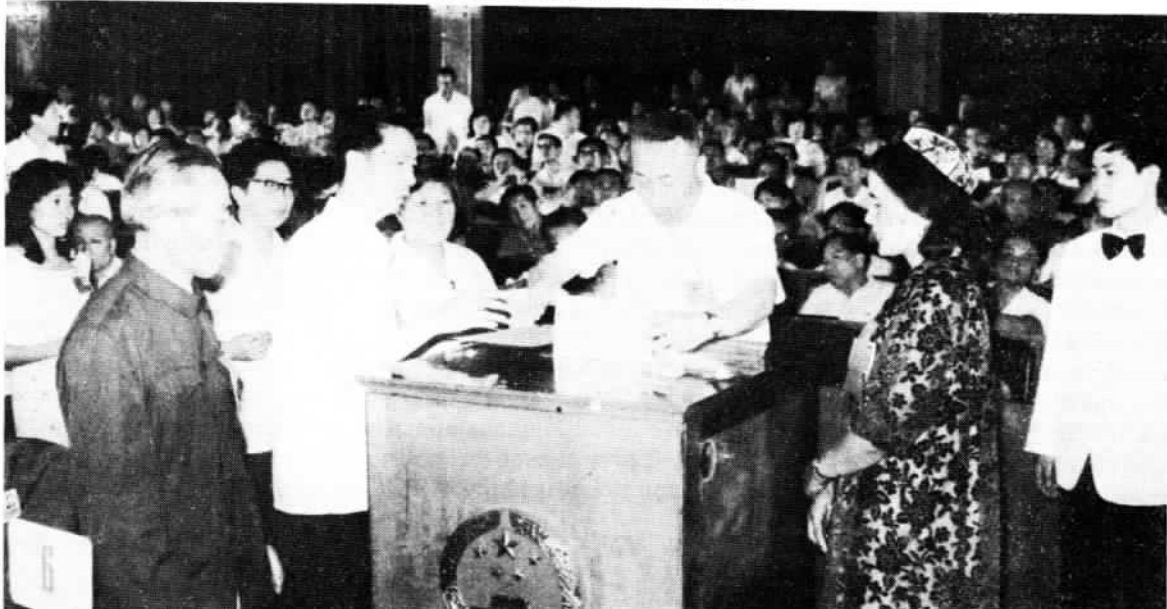
Deputies casting their votes.