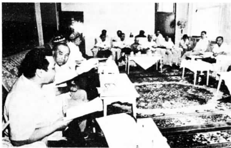
Deputies from Xinjiang Uygur Autonomous Region.

I think it is not fair to negate the merits and achievements of the Communist Party by just looking at the "anti-Rightist struggle" and the 10 years of the "cultural revolution." Chairman Mao led the Chinese people to overthrow the "three big mountains" (imperialism, feudalism and bureaucrat-capitalism) and established a powerful New China. This is very great contribution. He made mistakes in his later years, but we should not deny his contributions and role just because of this. There is not a single man in the world who does not make any