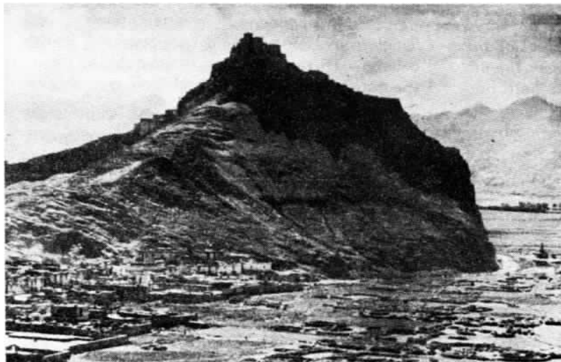
The Zongshan Hill in Gyangze where the Tibetan people resisted the British imperialist armed invasion in March 1904.

In fact, no treaty concerning Tibet after the two wars had