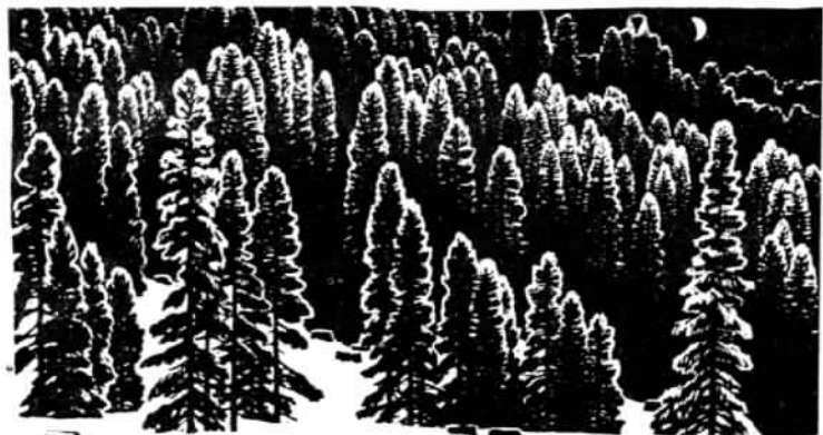
Pine Forest Under Moonlight