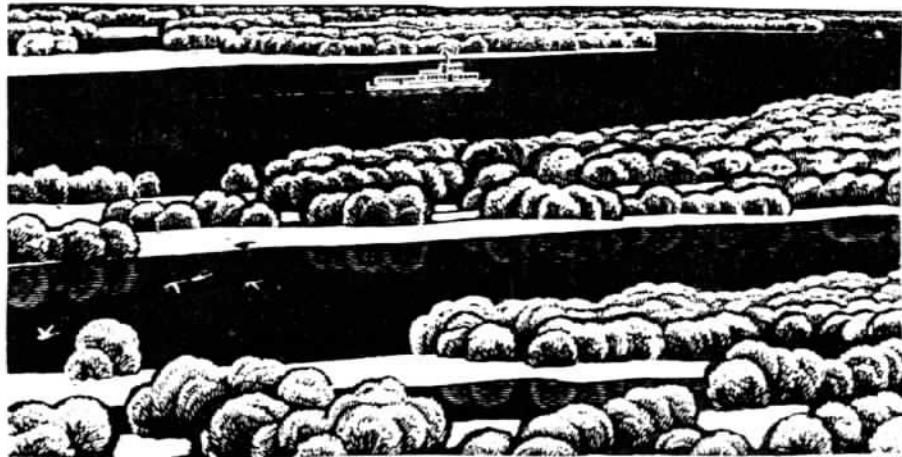
Early Snow on Heilong River.