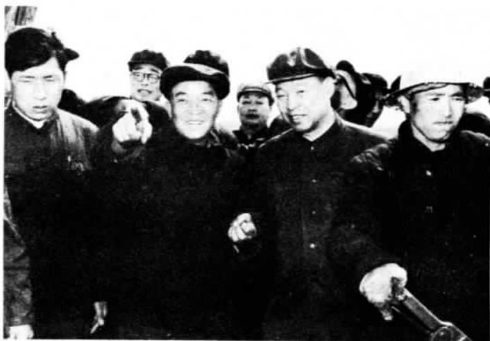
Top: Li Xiannian at work.