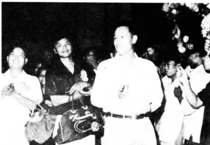
Bottom Right: Zhao Ziyang (third from left), then a leading member of the Guangdong provincial Party committee, welcomed representatives to a meeting at a railway station in June 1965.