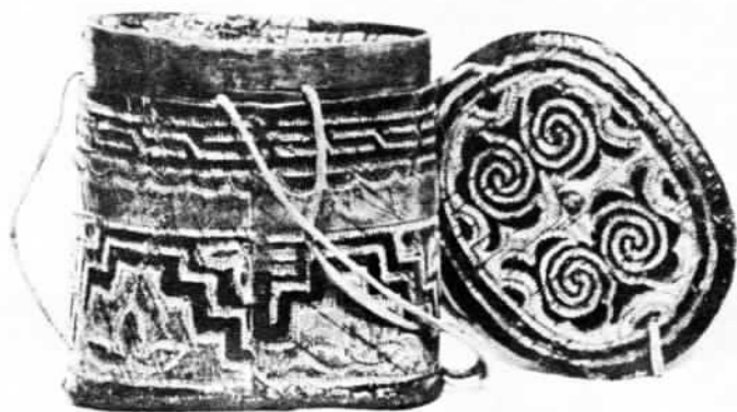
A box made of birch bark.

orange and blue, as well as gold and silver, have a harmonious inlaid effect.