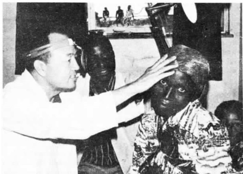
Chinese doctors in Zambia.

The Chinese Government always holds that aid is mutual. In helping other third world countries, China is helped by them as well.