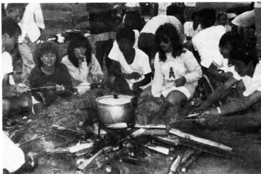
They enjoy cooking a Chinese meal themselves.