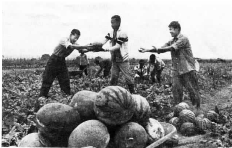
Chinese watermelon has found a new home in Congo.

6. The Chinese Government provides the best-quality equipment and material of its own manufacture at international market prices. If the equipment and material provided by the Chinese Government are not up to the