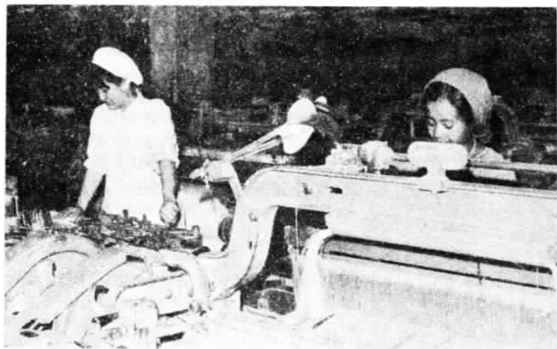
With the help of Chinese technicians, textile workers in North Yemen learn how to produce terylene cloth on looms which used to produce only cotton cloth.

regular operation before a trial-production is conducted and acceptance tests are made by the recipient country.