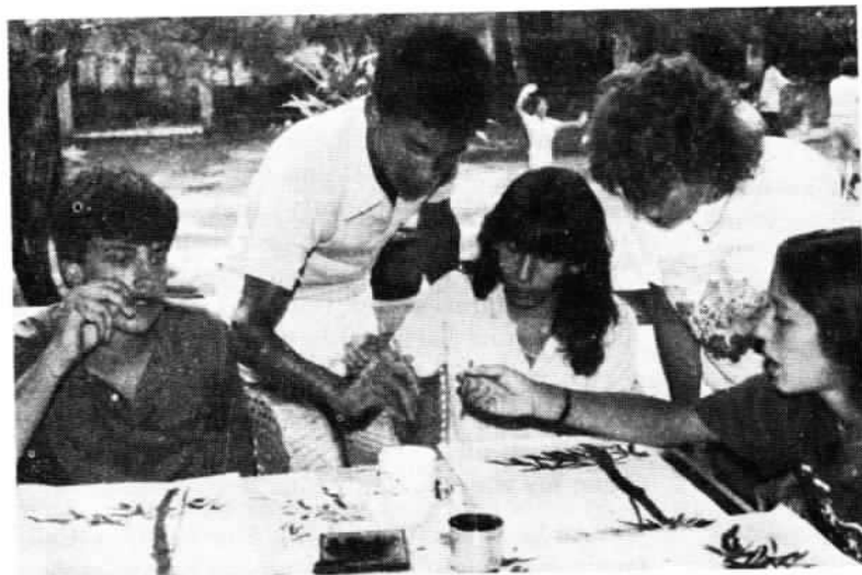
Young tourists learning traditional Chinese painting.

Numerous youths were shocked by the low level of rural medical care, and other signs of China's plight as a poor developing country. But most expressed confidence that the Chinese people will eventually overcome these ills. □