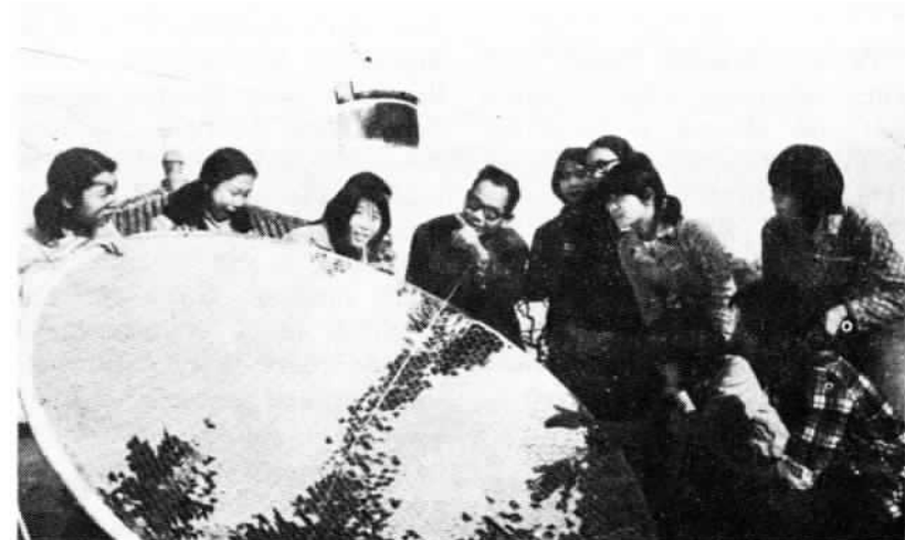
Students of the Zhixin Middle School of Guangzhou experimenting with a solar energy device. Over 90 per cent of the students in this school take part in extracurricular activities.

Exhibitions and Competitions. At a 1979 national exhibition of teenagers' scientific and technical work, 2,700 items were