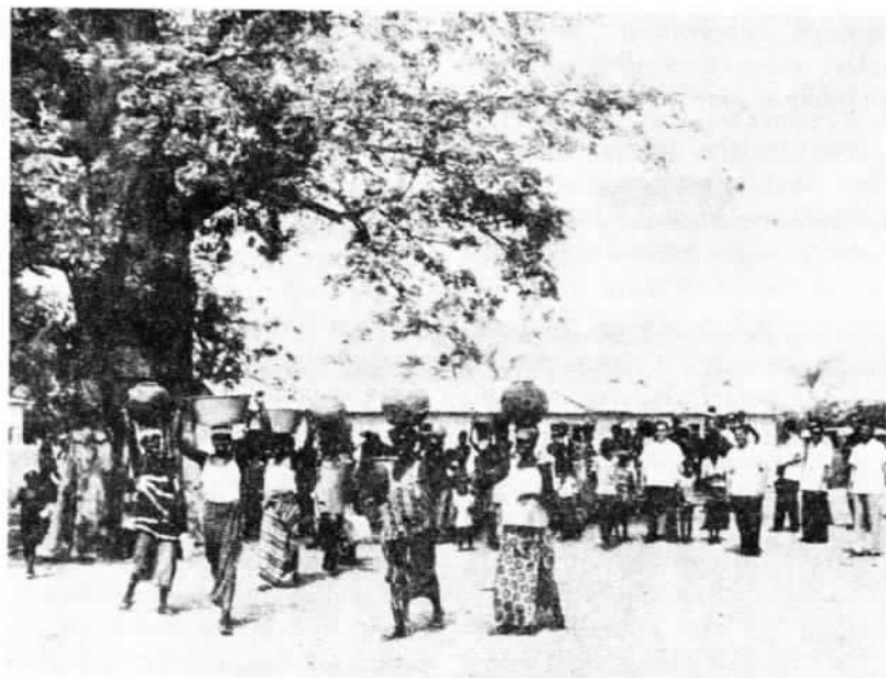
A jubilant scene in once water-poor rural Senegal, after a Chinese engineering team successfully sank a well there.

Once construction gets under way, the Chinese engineers and technicians will organize the engineering work and give technical guidance to local workers, strictly according to the requirements of the blueprints and the agreements reached between the two countries. Their aim is to ensure the quality of work done and see to it that construction and equipment installation are completed on schedule. No project will go into