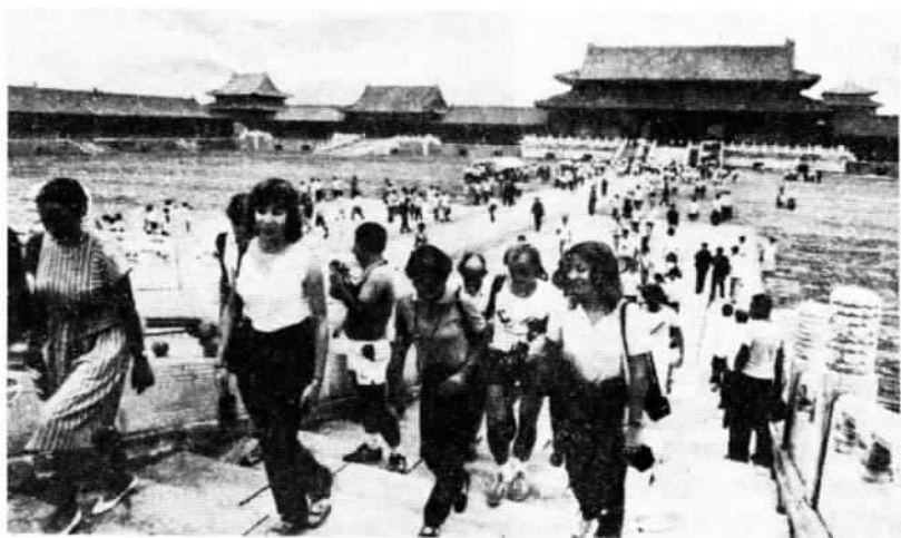
US students visit the Palace Museum (Forbidden City).

"Then we went to the Friendship Store and half an hour later when we came out, she was waiting with her father to give me a present. It was a small child's handkerchief, which she had been very proud to show us earlier. Her