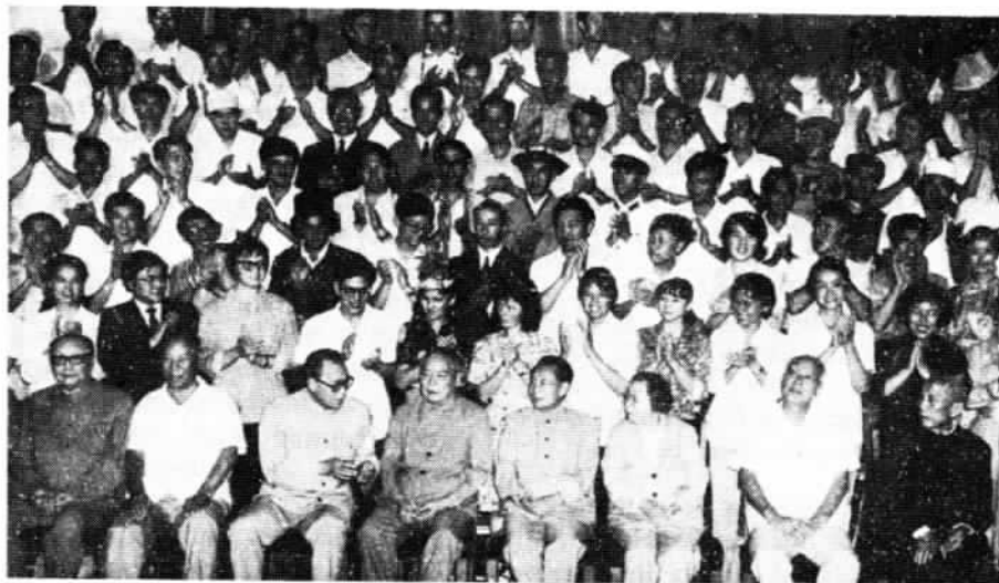
Party and state leaders (sitting in front) have a picture taken together with participants from the two meetings.

In the future, the two Chinese organizations will begin programmes to further ideological education among the young.