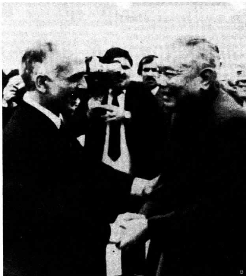
King Hussein of Jordan greets President Li Xiannian at the airport.

tinian people and the peoples of Namibia, Kampuchea and Afghanistan in their struggles for the right to self-determination. "Jordan will strive with other peace-loving countries to end all forms of colonialism, aggression and armed occupation of other's territory under any pretext," Hussein said.