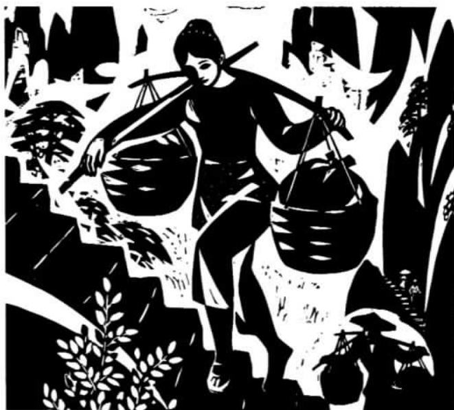
On the Path in the Huangshan Mountain.