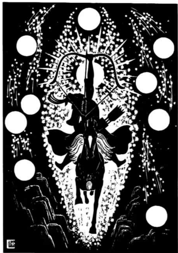
Scenes From Chinese Folklore.