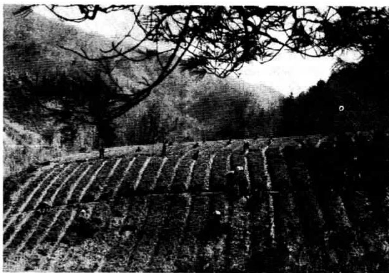
Workers dig out tree saplings from a nursery in Gansu Province.

A circular issued by the Party Central Committee and the State Council at the beginning of this month emphasized that forestry policies should be more flexible.