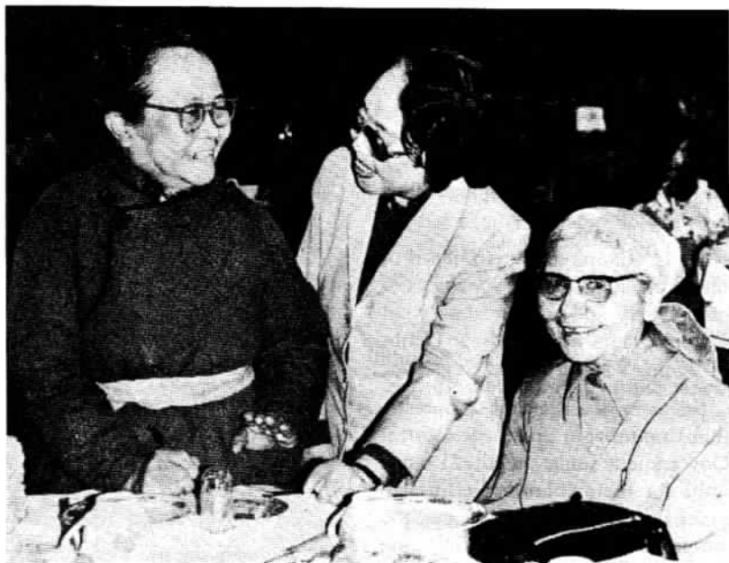
At the tea-party commemorating International Working Women's Day in Beijing.