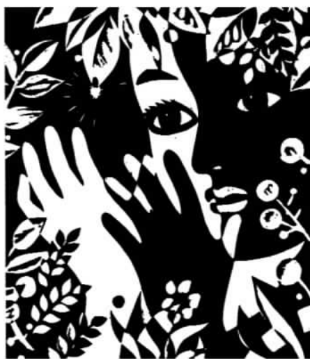
Girl and a Firefly.