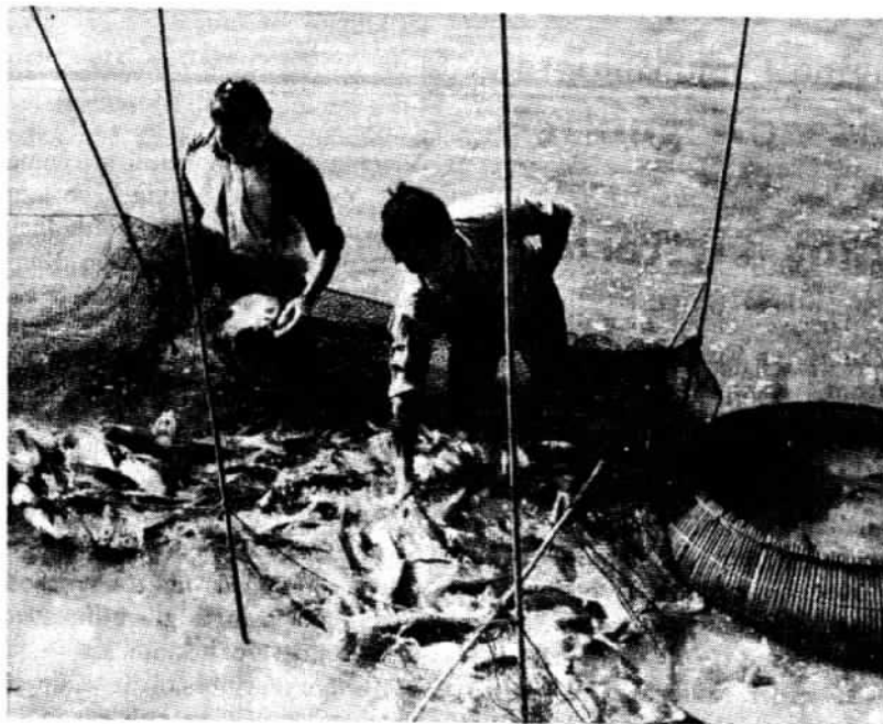
Guangdong peasants will sell these fish in a local market.