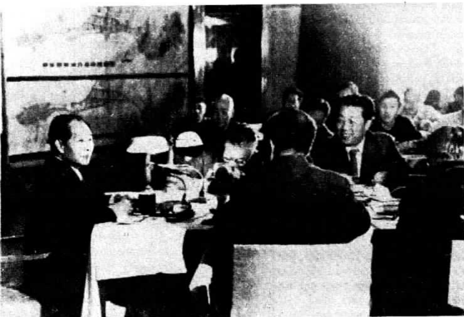
Hu Yaobang speaking during his inspection tour of Shandong Province.

The Party Secretary also urged bold measures to widen the present