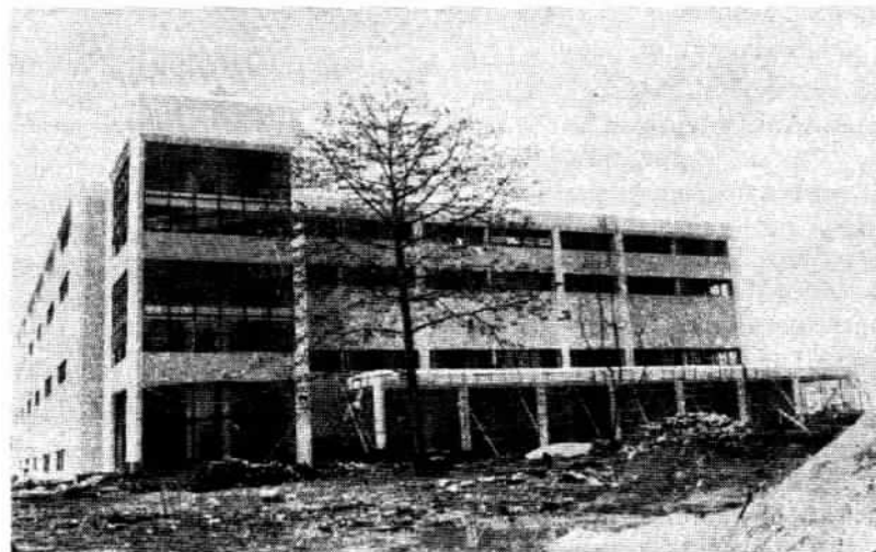
The Guangmei Foods Co. under construction.

Recalling the achievements of the past few years, Liu said there are good reasons to believe the reforms will lead to more foreign co-operation in Guangzhou and growth in the city's whole economy. □