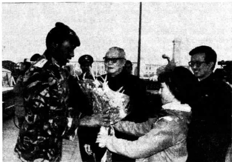
Chairman Sankara is welcomed by President Li Xiannian.

Sankara, who is the first head of state of Burkina Faso to visit China since diplomatic relations were established in 1973, arrived in Beijing on Nov. 5 for a five-day visit at the invitation of President Li Xiannian.