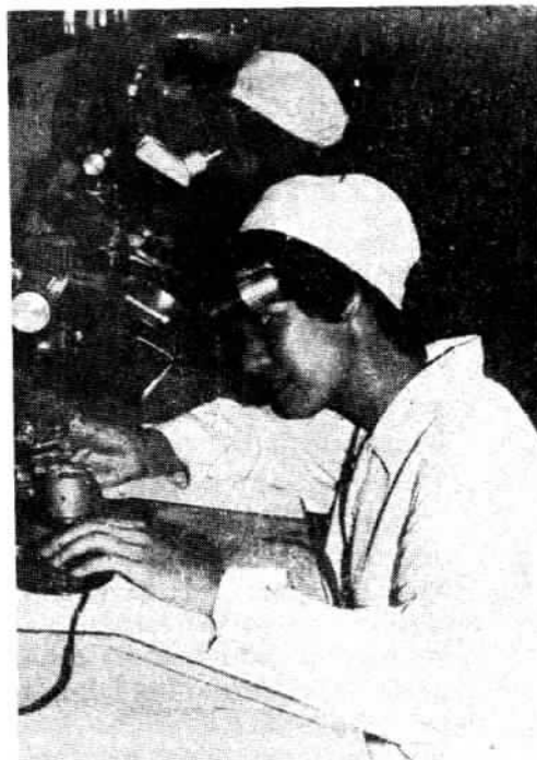
Young workers assemble quartz watches at the Guangzhou Wrist Watch Factory.

• Giving enterprises more decision-making power. Starting last month, all enterprises began