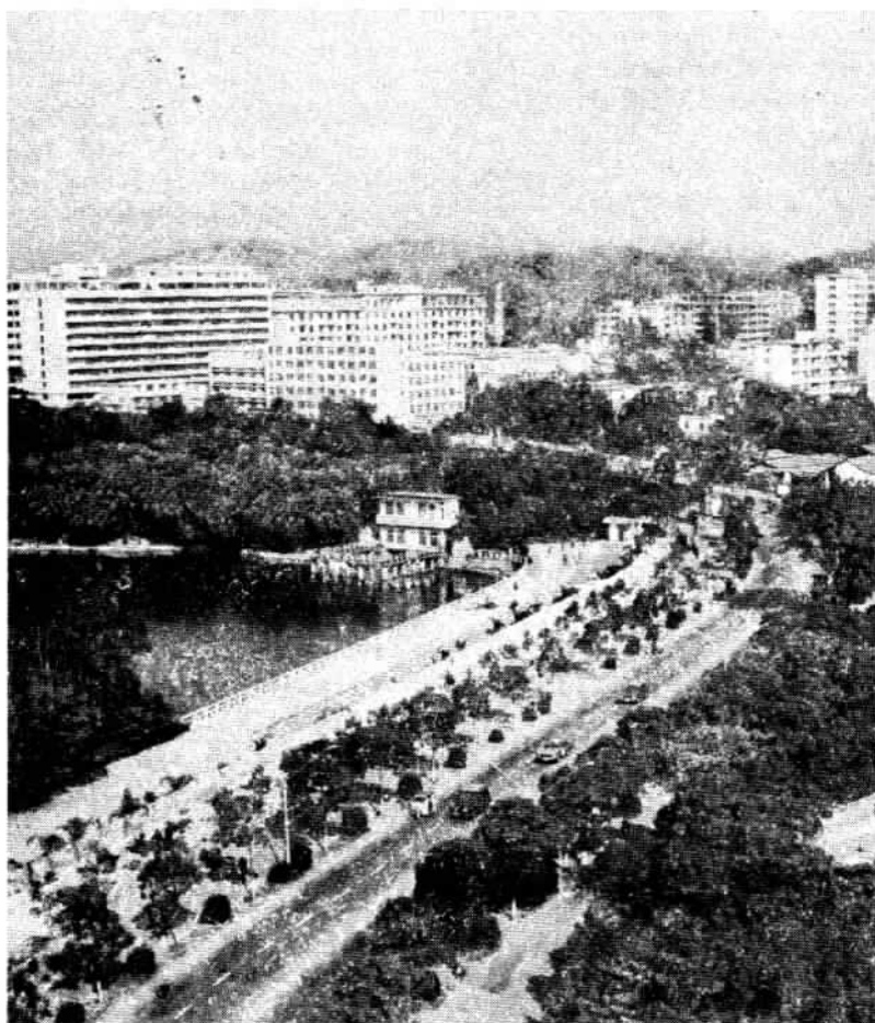
Guangzhou's foreign trade and commercial centre by the Liuhua Lake.

Now the China Hotel uses computers to handle managerial affairs and cost accounting. Apart from 13 administrators, all staff and attendants work under contract system. The term of the contract is usually about three years. The employees must re-