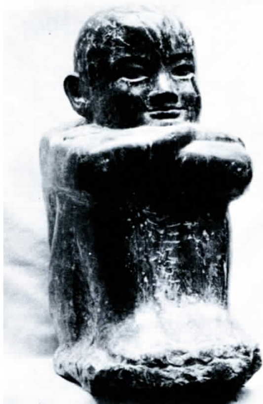
Smiling Boy (stone).