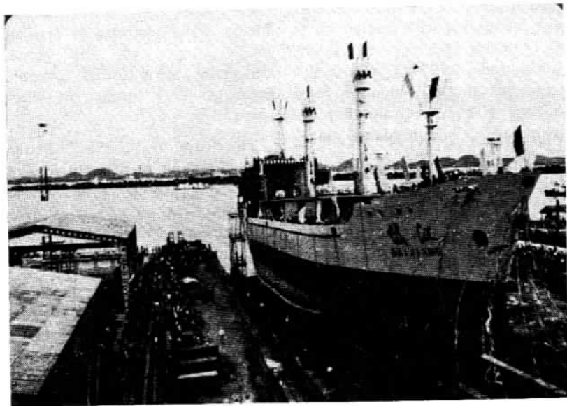
A freighter of the Guangzhou Shipping Co. is launched.

terprises and compensatory trade deals accounted for US$ 522 million, of which US$ 182 million has already been put to use. Contracts involving processing and assembling or manufacturing products according to foreign samples totalled US$ 655 million, of which US$ 130 million has been expended. Guangzhou is second only to the Shenzhen Special Economic Zone in total import value, total investment and net income.