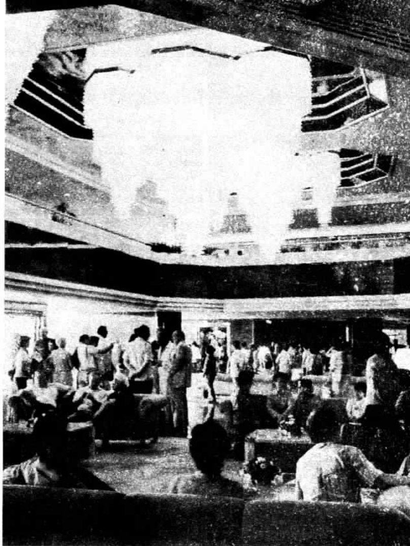
Lobby of the new China Hotel.

Prior to 1978 the factory was just a small printing house which produced primary school exercise-books and playing cards. The transformation of the factory