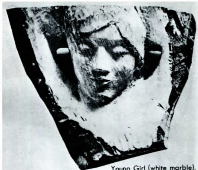
Young Girl (white marble).