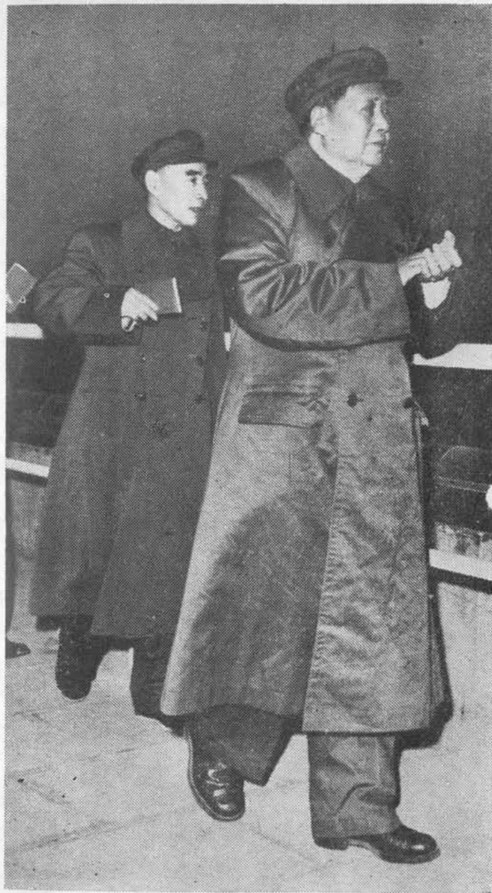
Chairman MAO TSETUNG and Vice Chairman LIN BIAO