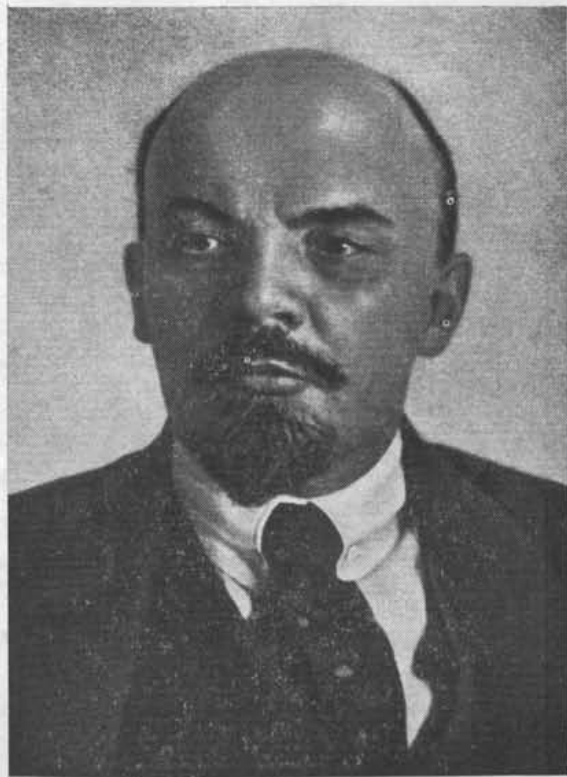
V. I. LENIN