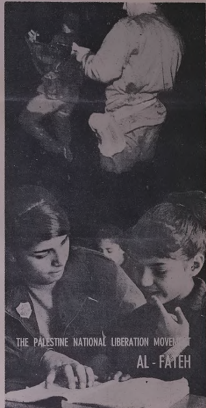
This is the cover of a pamphlet which has just been issued by the Information Office of the Palestine National Liberation Movement, al-Fateh. Copies of the 13-page pamphlet which deals briefly with the history of the Palestine problem, the emergence of al-Fateh, as well as its aims, objectives and position vis-a-vis Israel, the Arab Countries and the United Nations can be obtained by writing to Post Box 5427, Beirut, Lebanon.

A peace, to be lasting, must leave no seeds of a future war, » perhaps is the most profound statement Nixon uttered. But the seeds of a future war can only be eliminated through recognition of the inalienable rights of the Arab Palestinians to their usurped and occupied homeland.